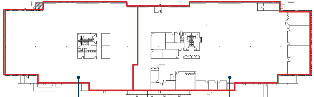
BUILDING C 2355 Briargate Parkway