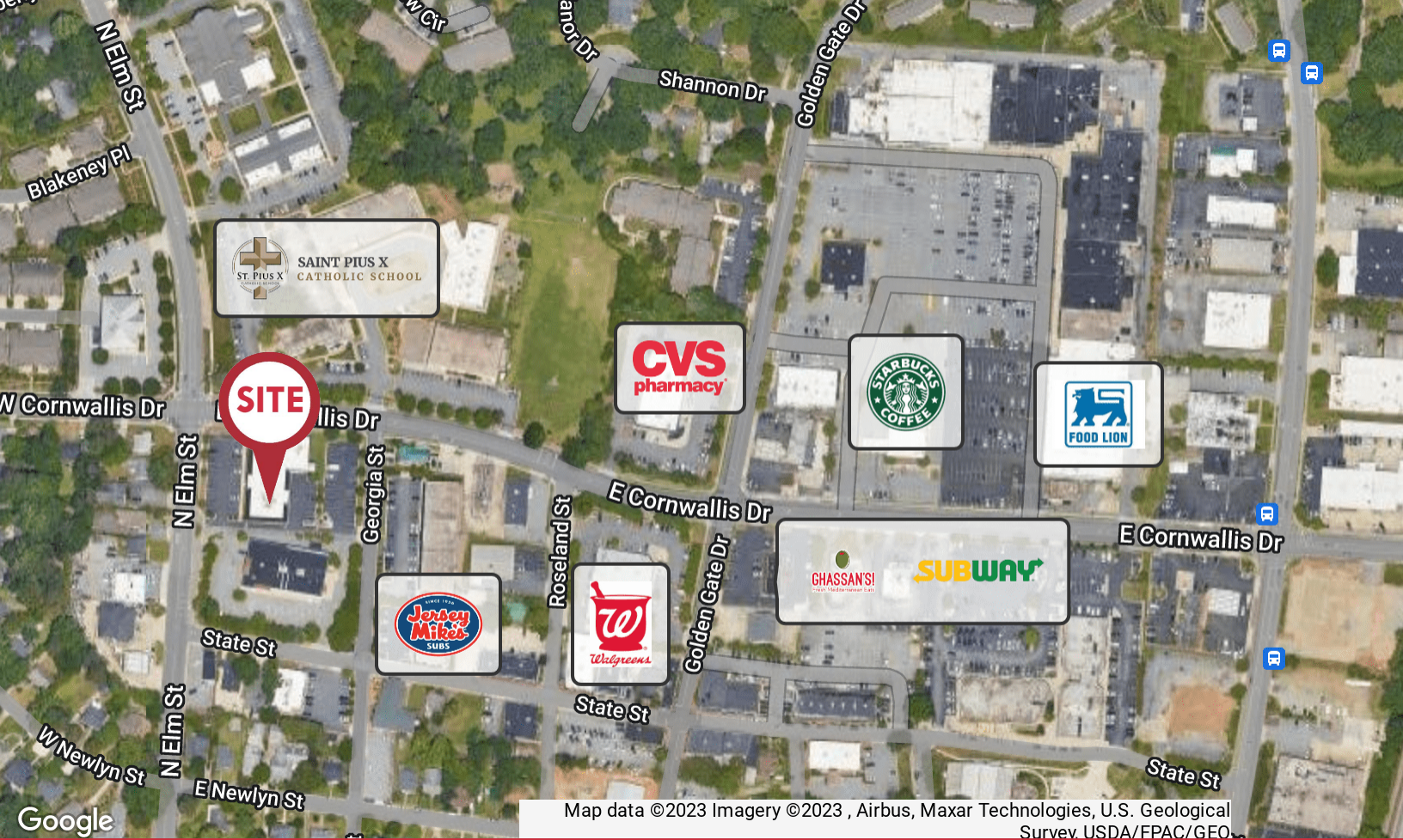
Map data ©2023 Imagery ©2023, Airbus, Maxar Technologies, U.S. Geological Survey, USDA/FPAC/GE...