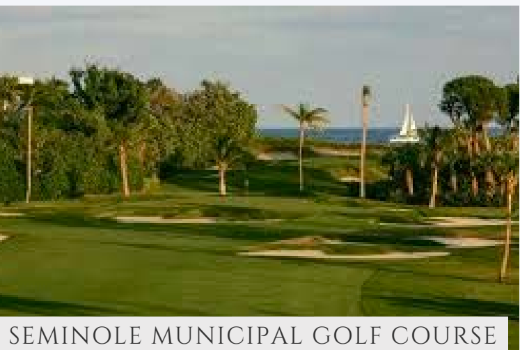
SEMINOLE MUNICIPAL GOLF COURSE