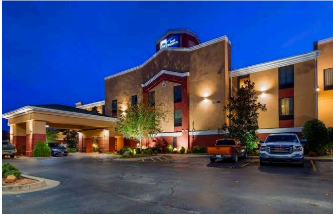
Best Western Seminole