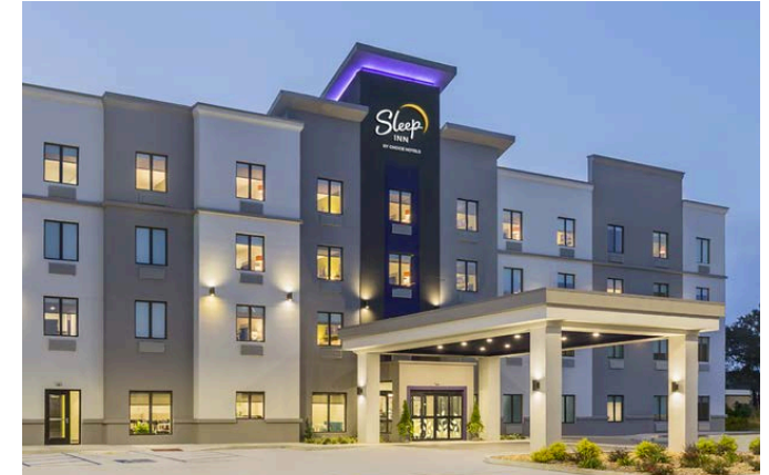
Sleen Inn Suites