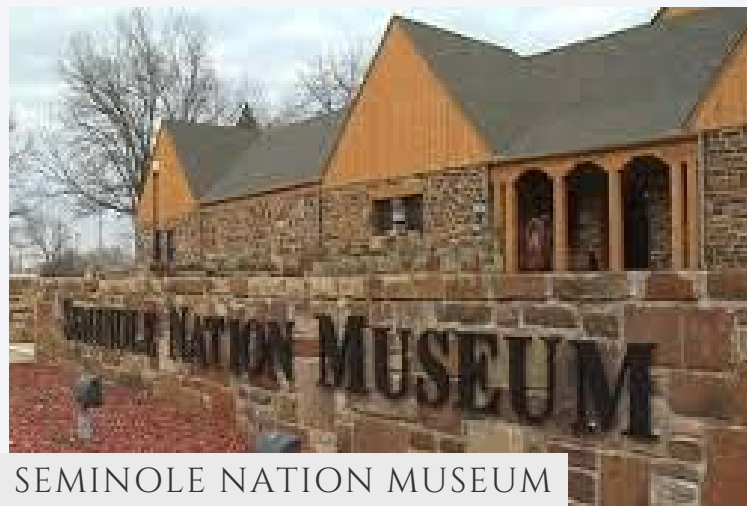
SEMINOLE NATION MUSEUM