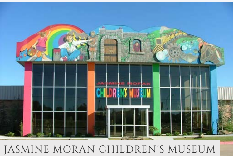
JASMINE MORAN CHILDREN'S MUSEUM