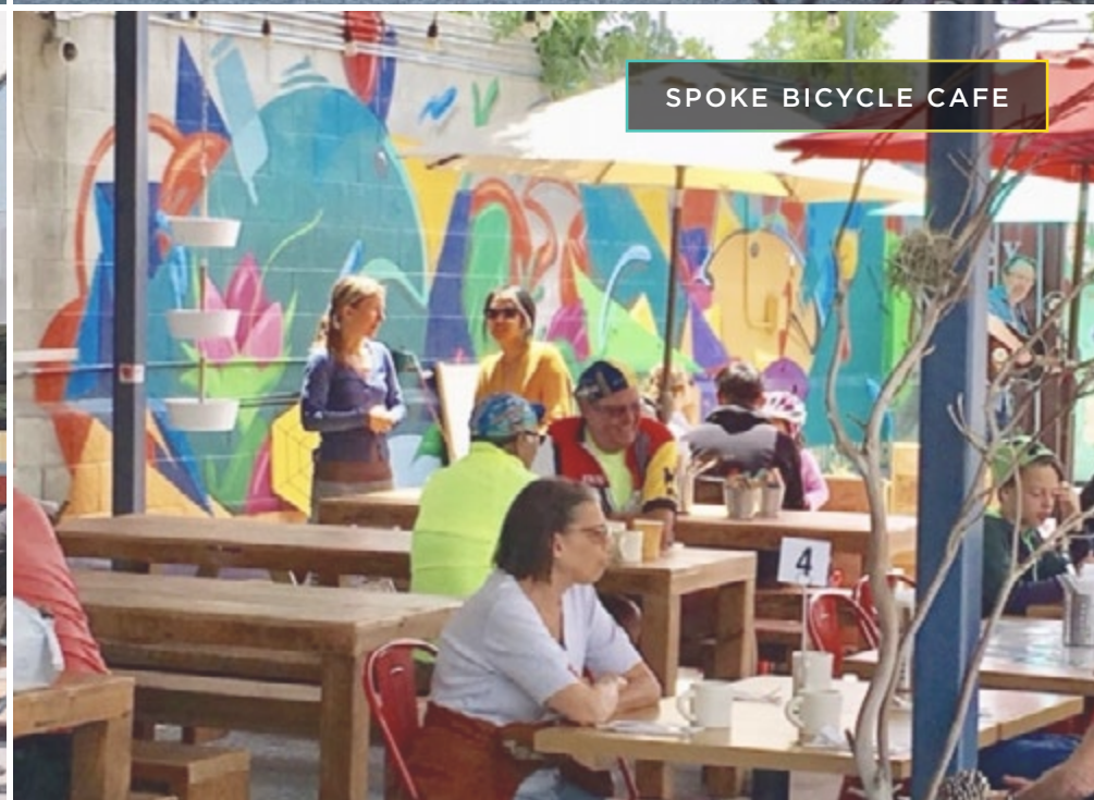
SPOKE BICYCLE CAFE