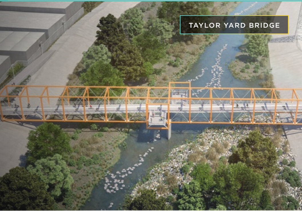
TAYLOR YARD BRIDGE