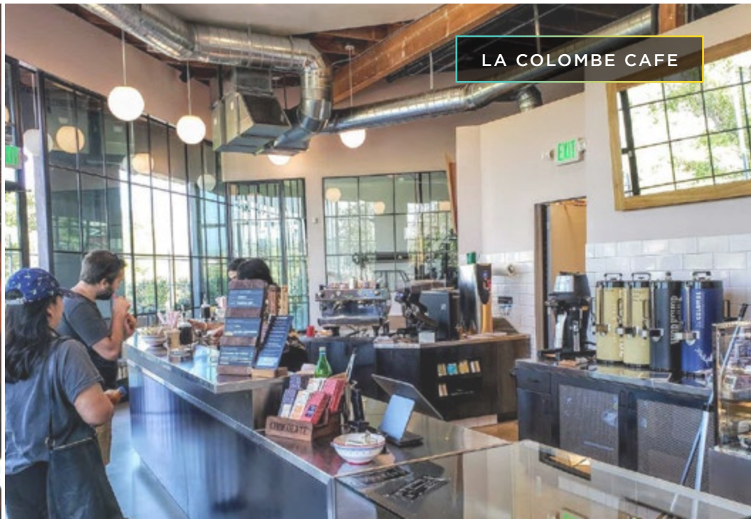
LA COLOMBE CAFE