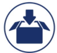
LOGISTICS & DISTRIBUTION

The Rockford Region consists of Boone, Ogle, Stephenson, and Winnebago counties in northern Illinois. The area lies in the heart of the Midwest, and in very close proximity to Chicago, Milwaukee, Madison, Quad-Cities, and Peoria. Its central time zone location allows your company to reach customers from coast to coast during normal business hours.