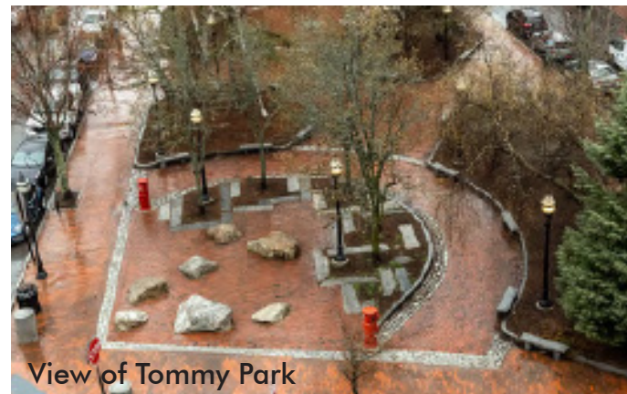
View of Tommy Park