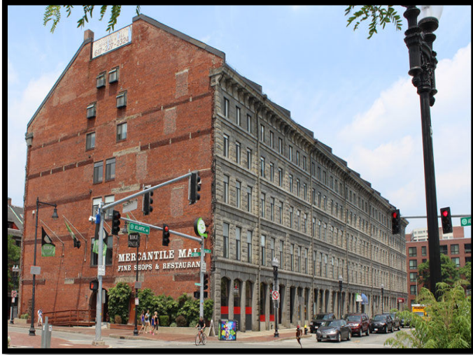
Mercantile Wharf Building