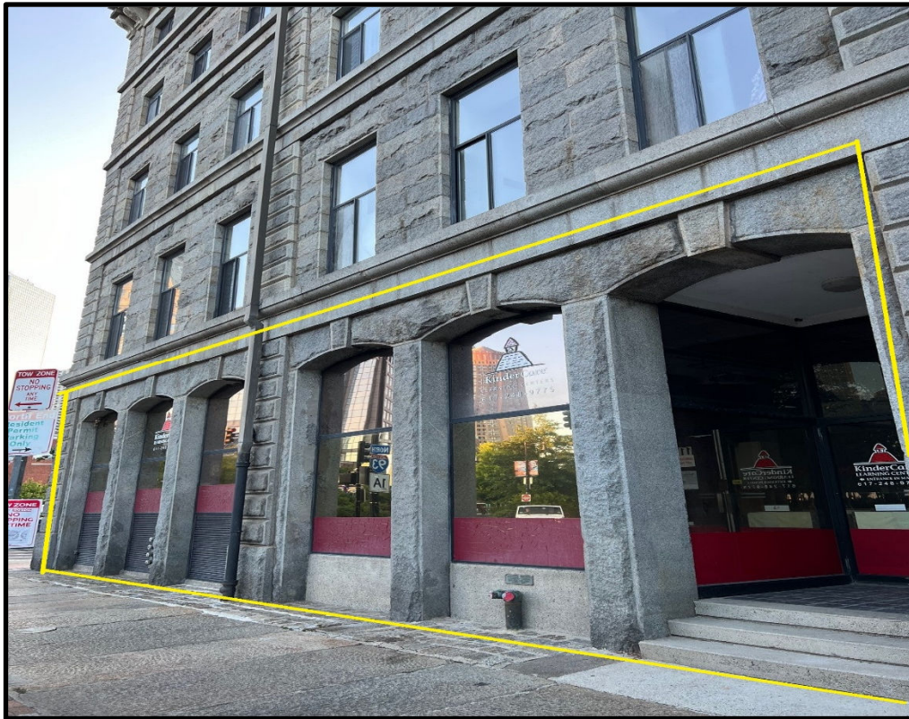
1,481 SF OF RETAIL/OFFICE SUITE