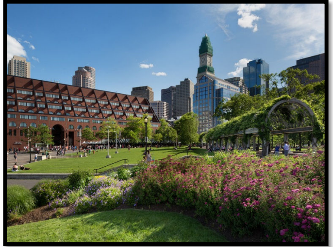
Christopher Columbus Park