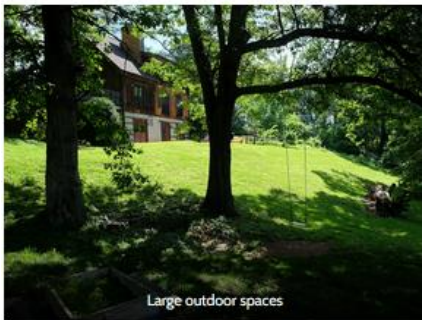
Large outdoor spaces

Both buildings are wheelchair accessible. The Sugarloaf facilities are available for rental in whole or in part. To inquire about rentals, please contact us at rentals@scuu.org .