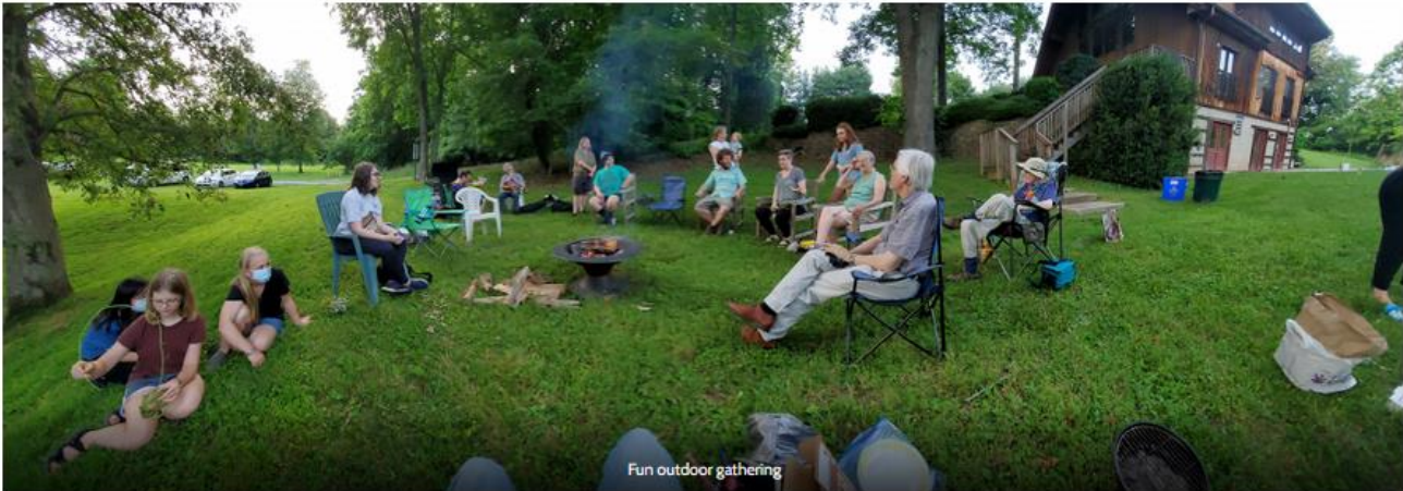
Fun outdoor gathering

Sugarloaf is a small Unitarian Universalist church located on five beautiful acres bordering Seneca Creek State Park, with a charming yurt and a mountain-style frame house with large gathering space, several smaller rooms, and a half kitchen.