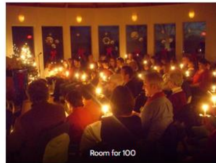
Room for 100

Parking is available for 50 cars including handicap spaces