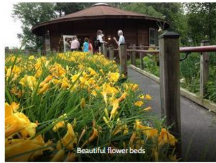
Beautiful flower beds