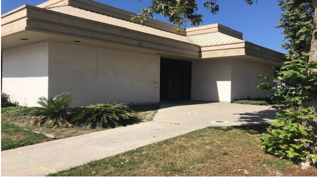
Front entrance of building