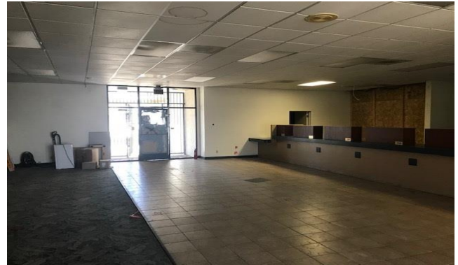
Current interior build out