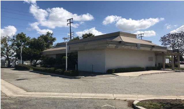
Back side of building and parking area