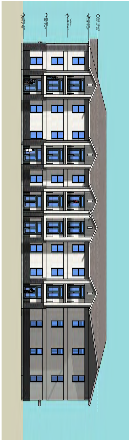
02 North West Elevation (facing Open space) Scale 1/8"=1'-0"