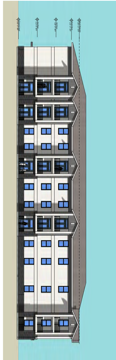
01 South East Elevation (facing Parking lot) Scale 1/8"=1'-0"