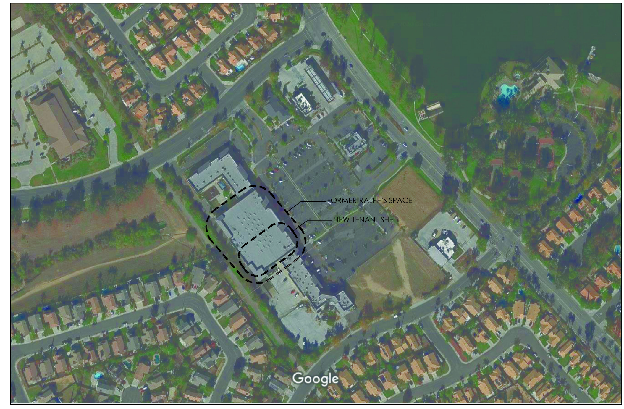
AERIAL PLAN SCALE: N.T.S.