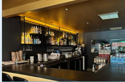
Restaurant and bar seating