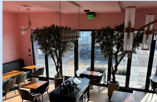
Intimate dining spaces