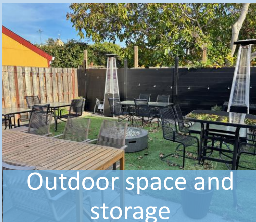
Outdoor space and storage