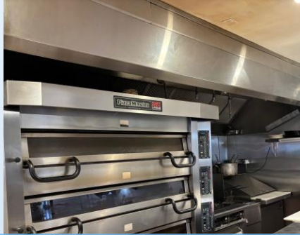
Fully built-out kitchen