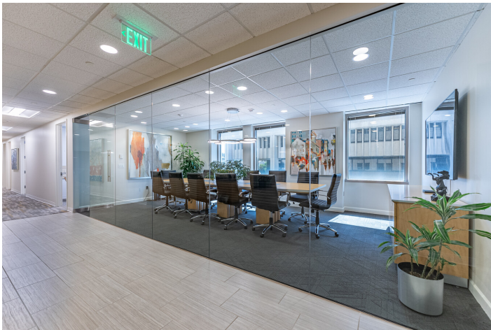
210 Nemphos Conference Room