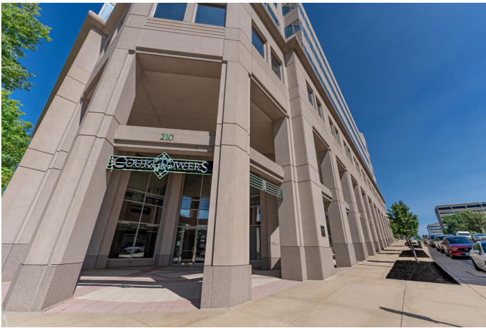
210 Sign Band