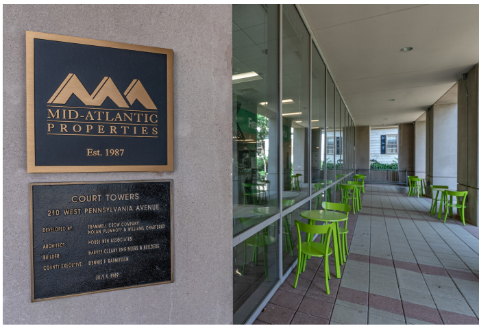
210 Sign Plaque