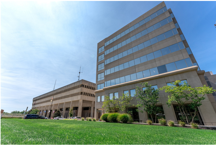
210 + CourtHouse