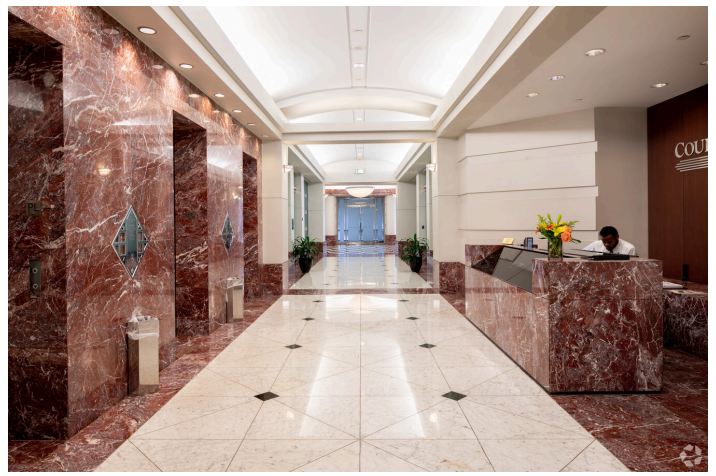
Lobby Elevators and Security Desk