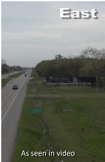
As seen in video

This property is conveniently located eight miles West of down town Saginaw, 10 miles West of I-75 and 14 miles South West of MBS International airport with easy access in and out of the property and is zoned B3.