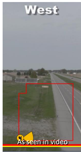
As seen in video