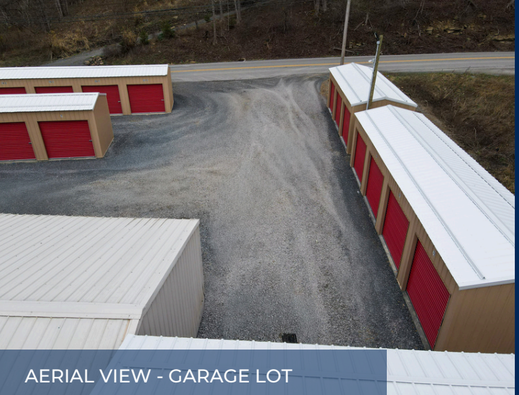
AERIAL VIEW - GARAGE LOT