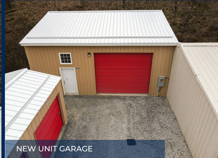
NEW UNIT GARAGE