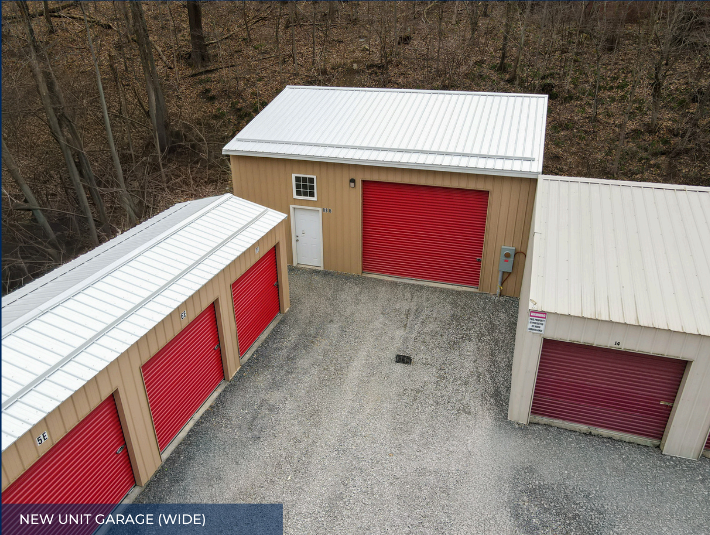
NEW UNIT GARAGE (WIDE)