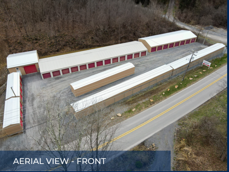
AERIAL VIEW - FRONT