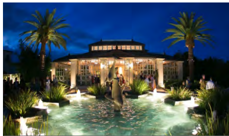
THE FOUR ARTS