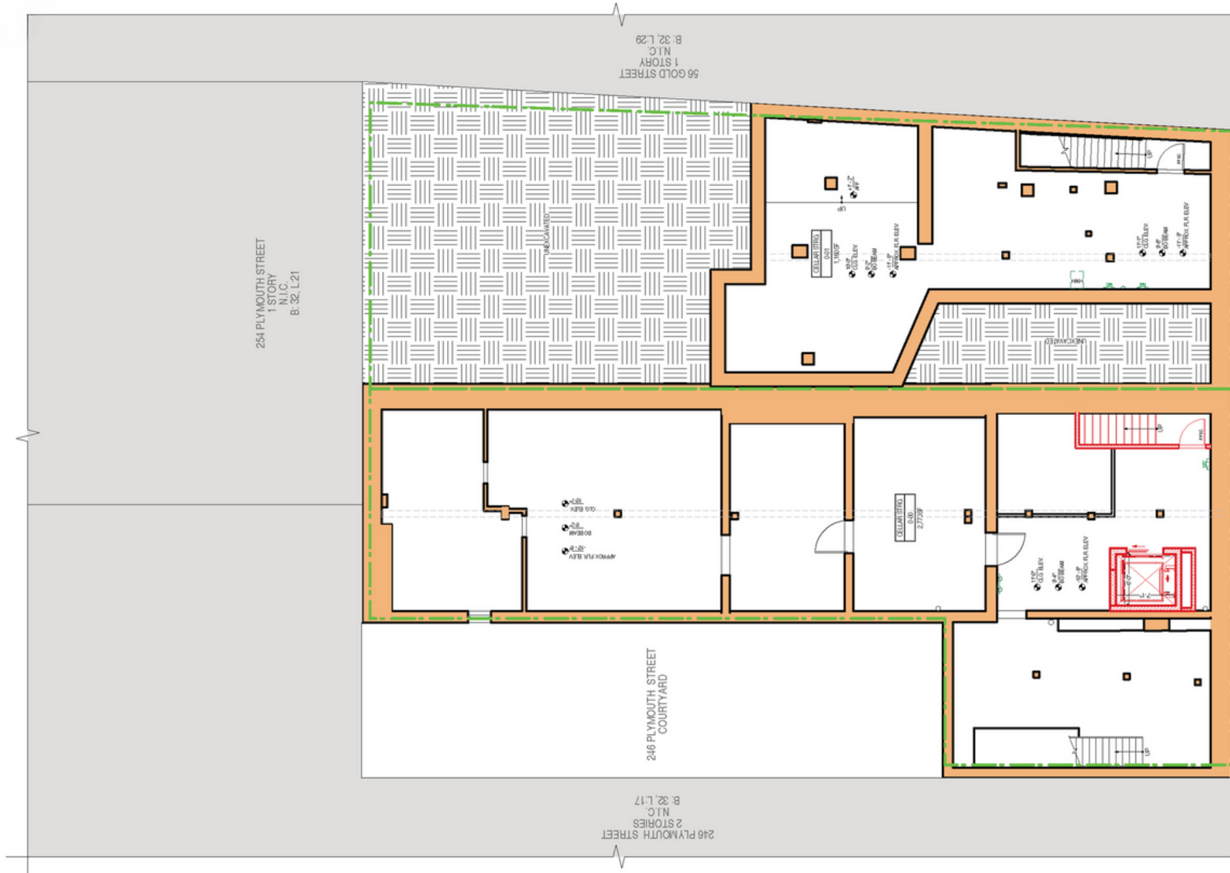
CELLAR FLOOR PLAN