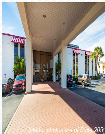
Interior photos are of Suite 205.