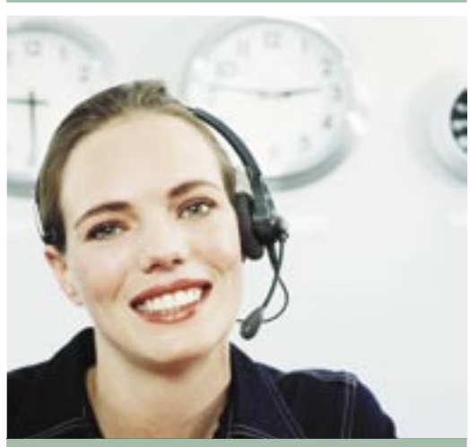
A highly trained business support team is always at your service.