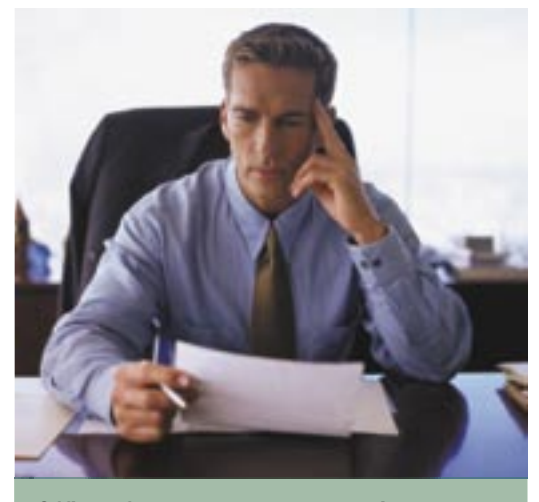
Offices for the way you do business.