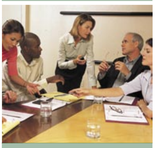
Access 3,700 meeting rooms located in a professional office environment with one call or click of a mouse.