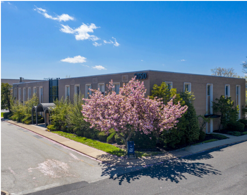
1050 N. KINGS HIGHWAY