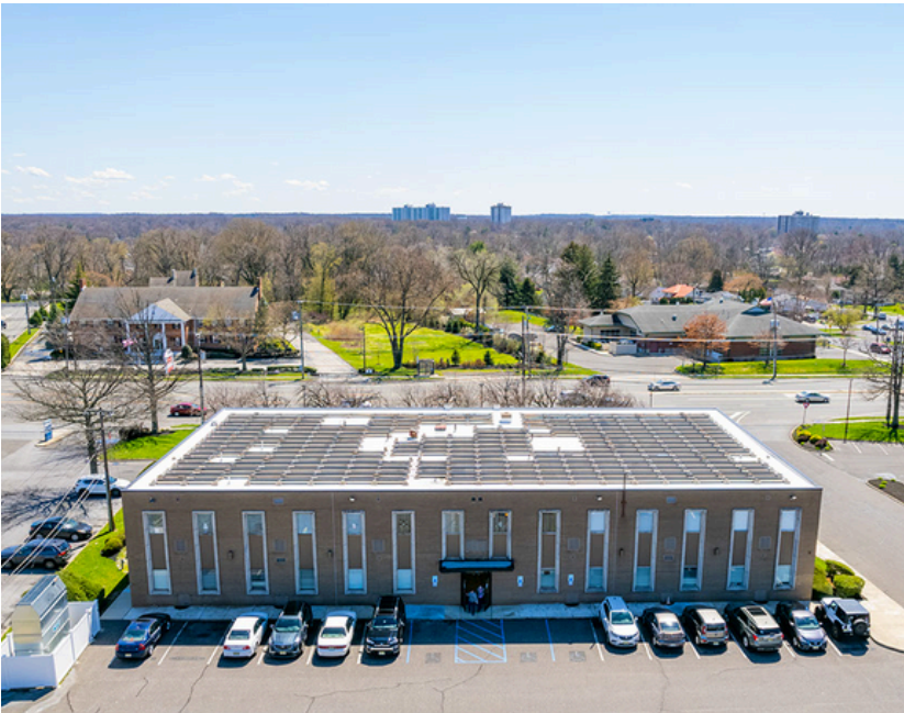
1020 N. KINGS HIGHWAY