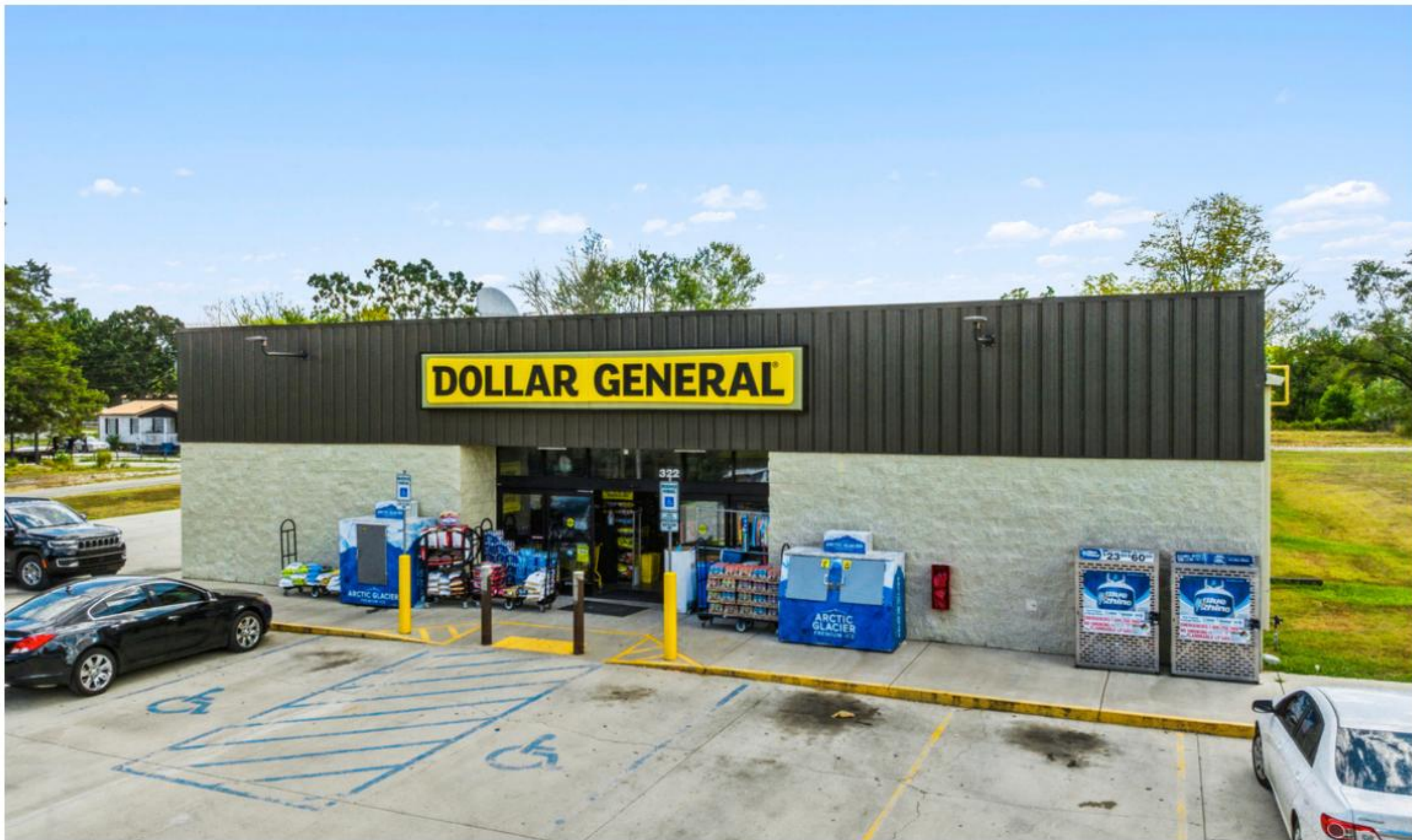
Dollar General Taneyville, MO