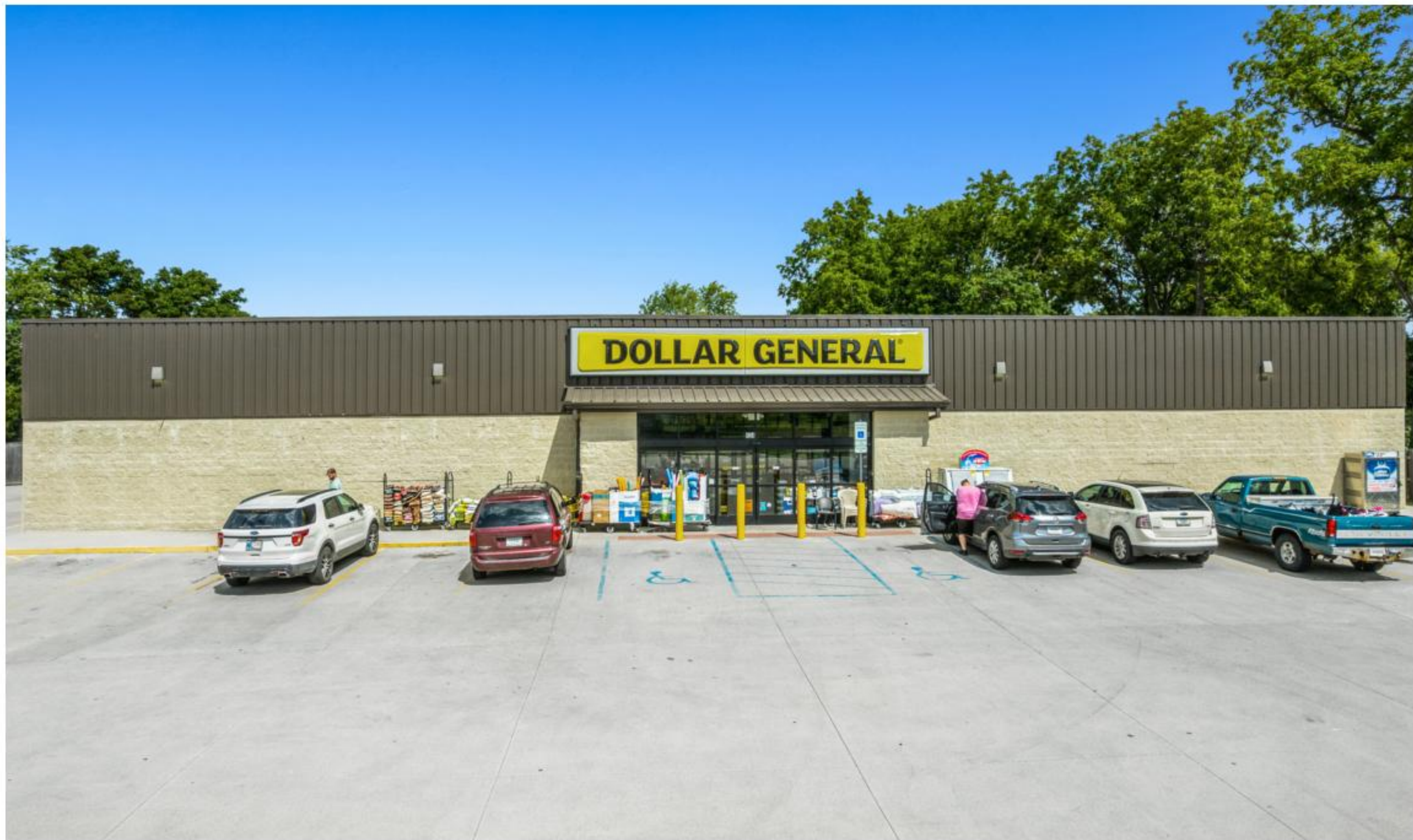
Dollar General Goodland, IN