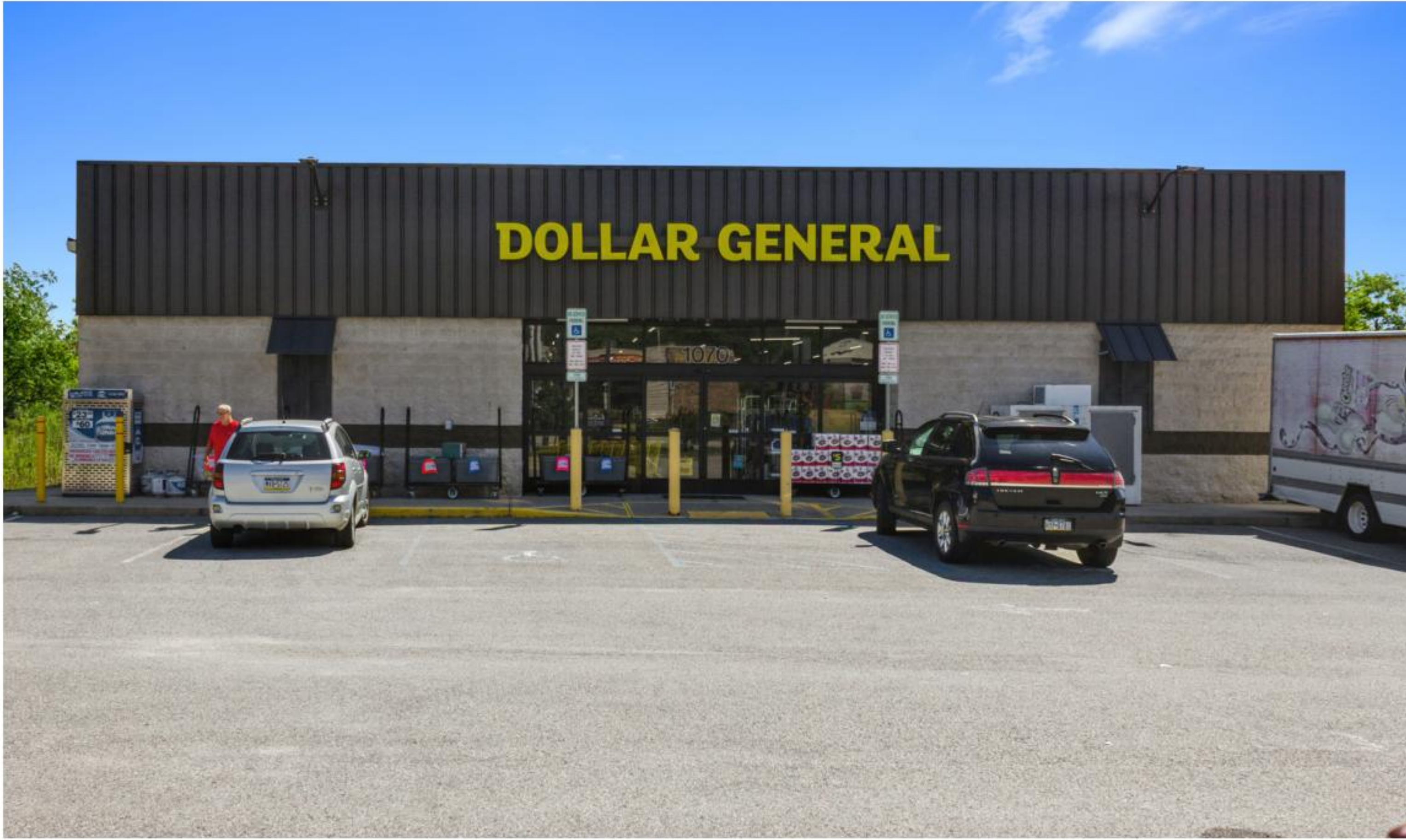
Dollar General Jeannette, PA