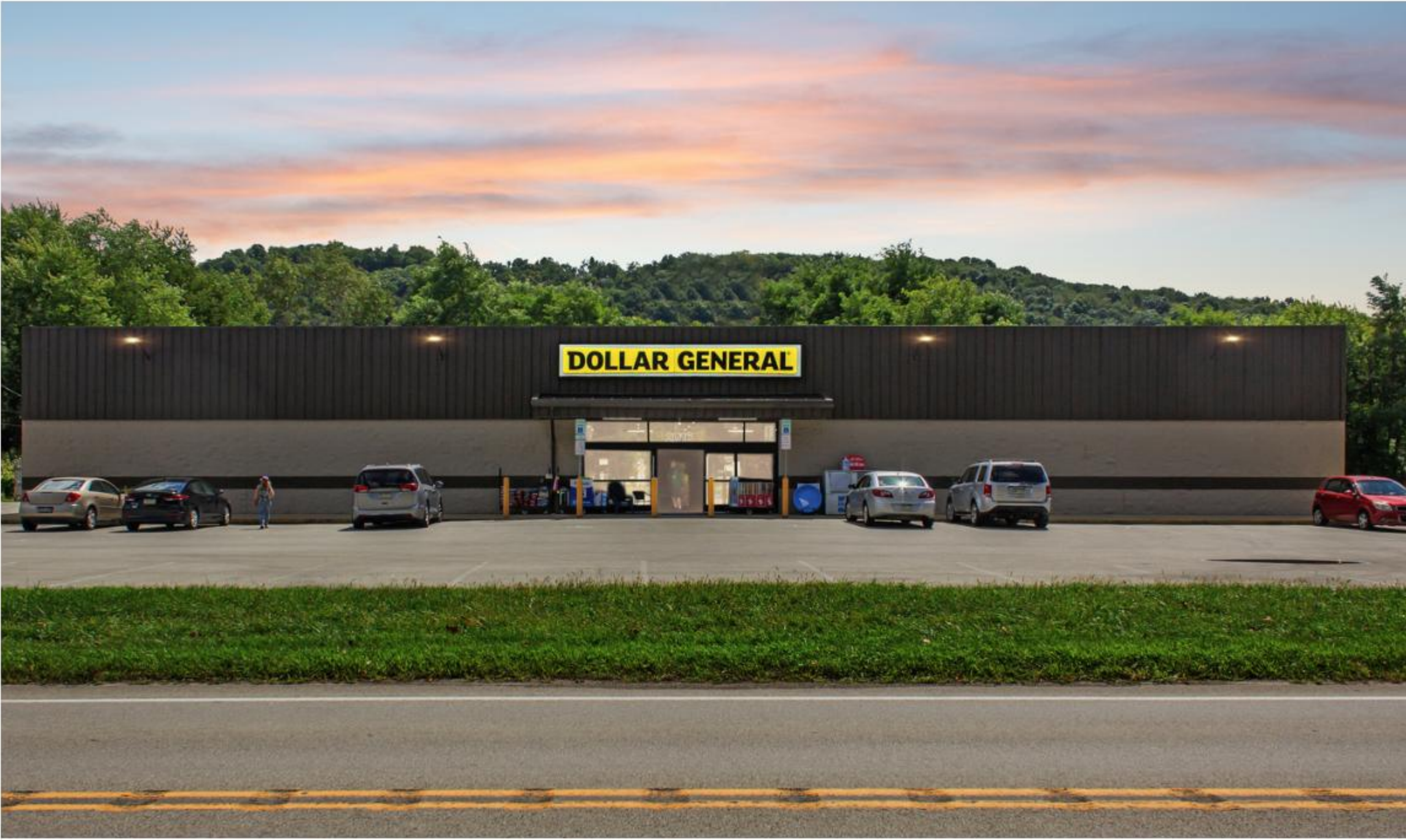
Dollar General North Apollo, PA