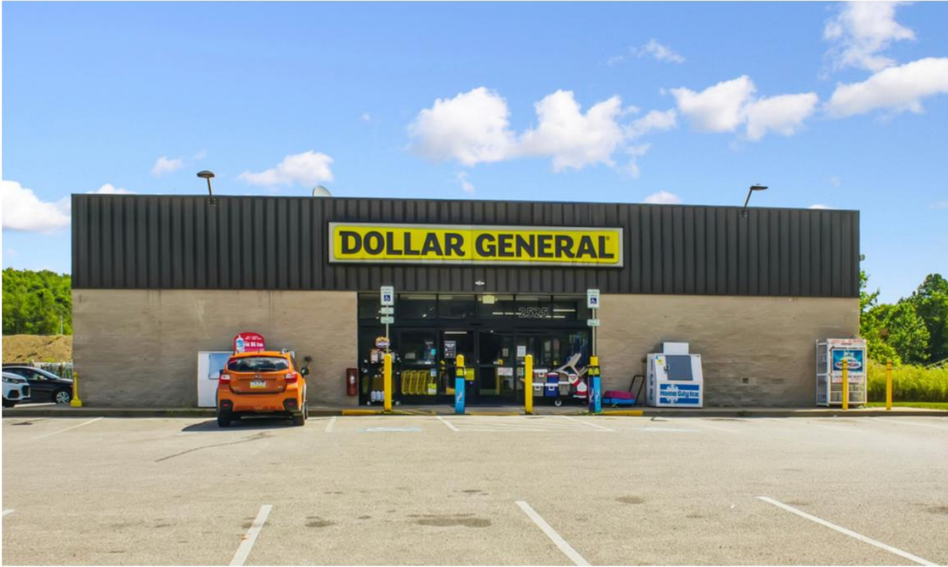
Dollar General Franklin, PA