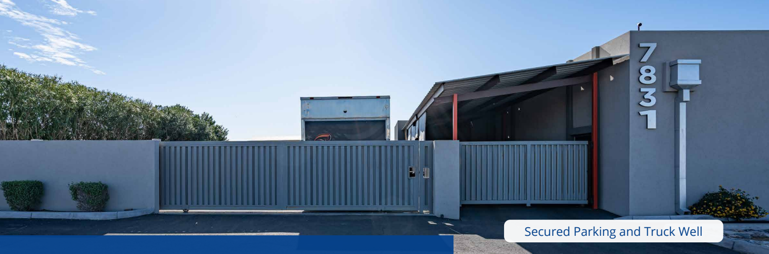
Secured Parking and Truck Well