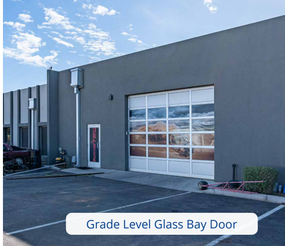
Grade Level Glass Bay Door