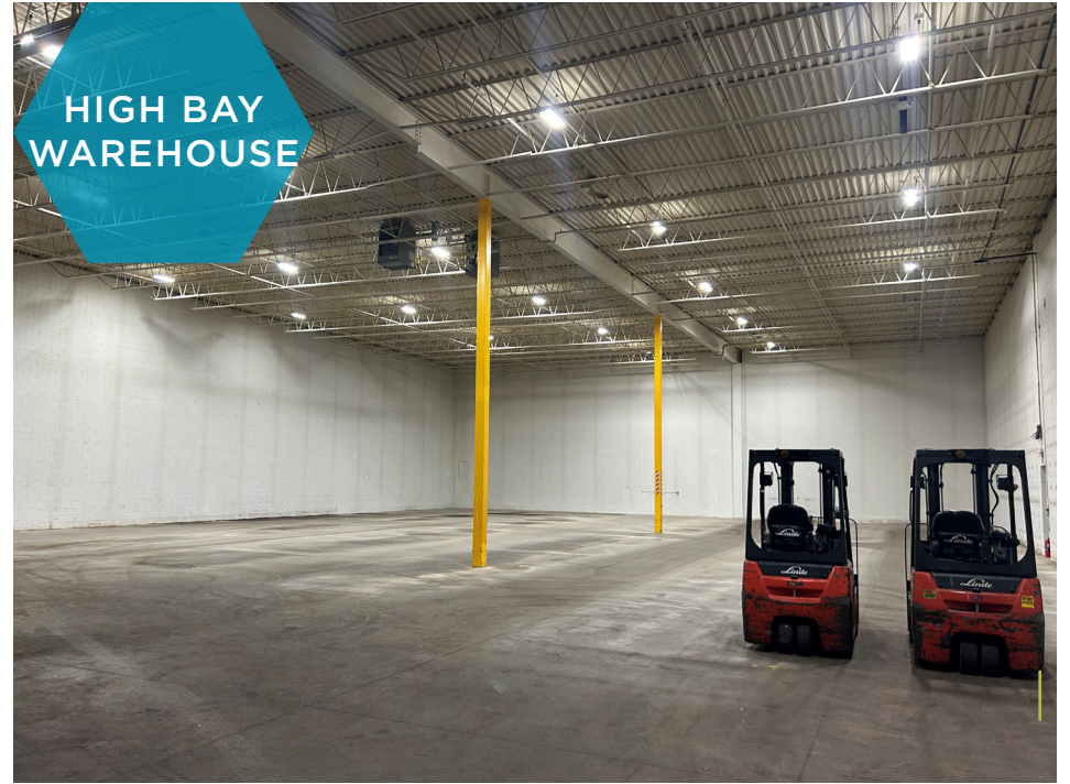
HIGH BAY WAREHOUSE