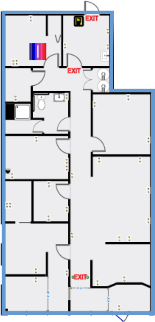
Endcap 1,637 SF