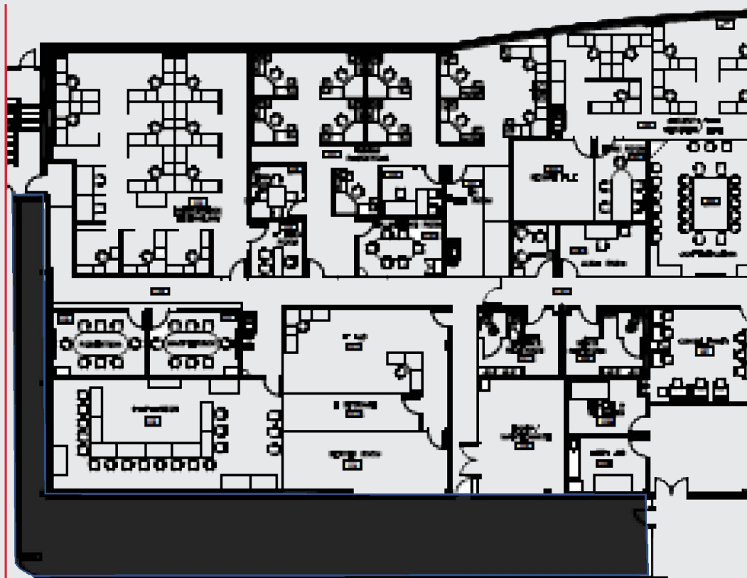
Suite 100: ~11,000 SF