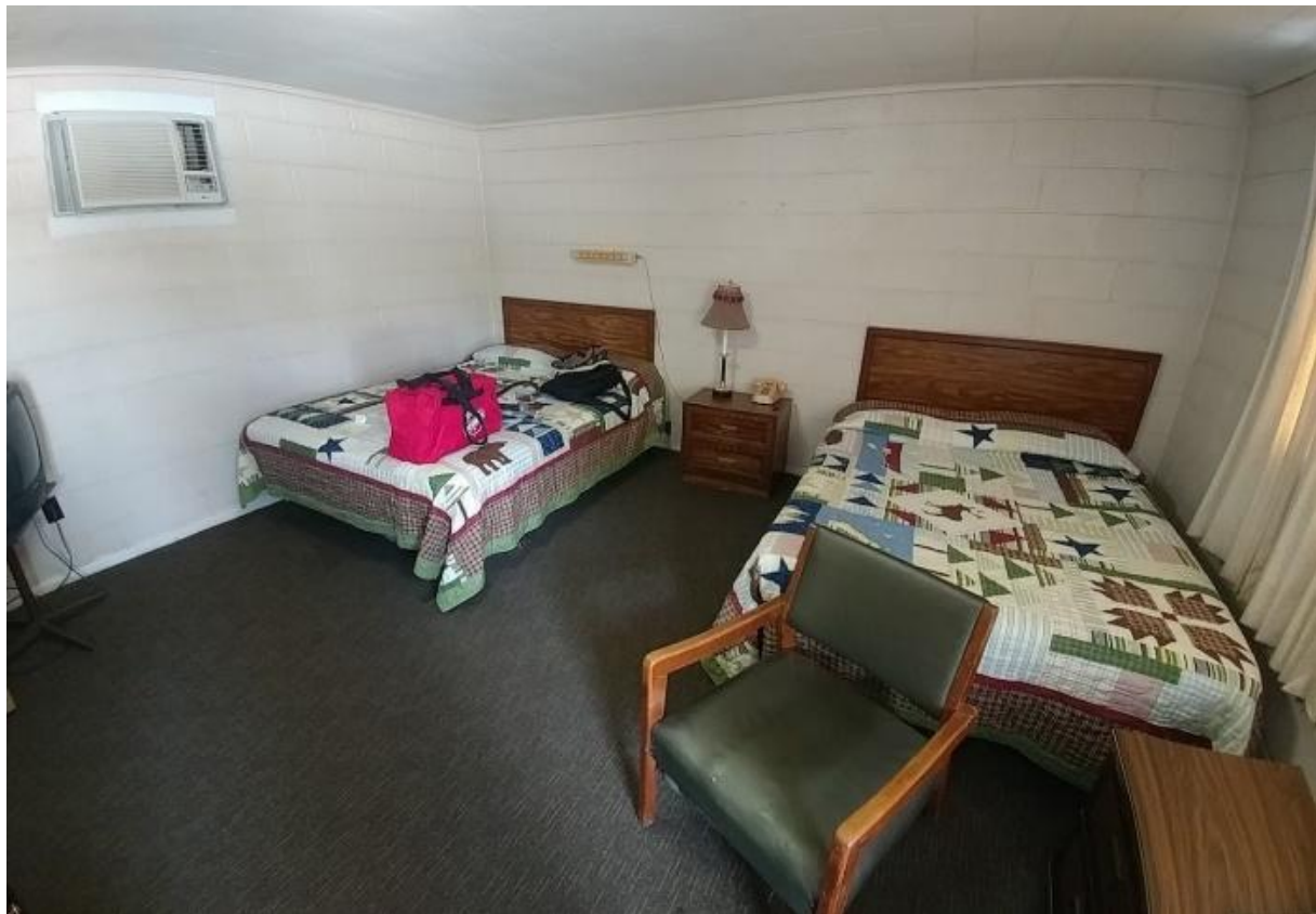
Jasper is a winter wonderland for hiking, atving