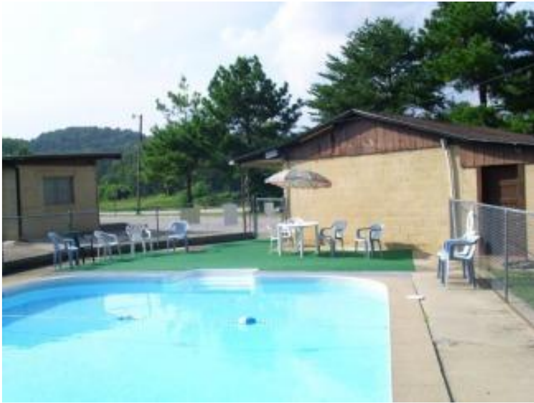
Popular pool to relax after a day of hiking, floating, biking, caving or 4-wheeling!