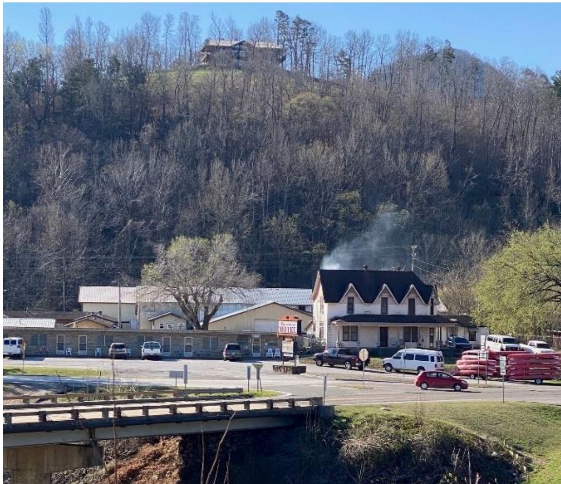
Loaded up for river fun!