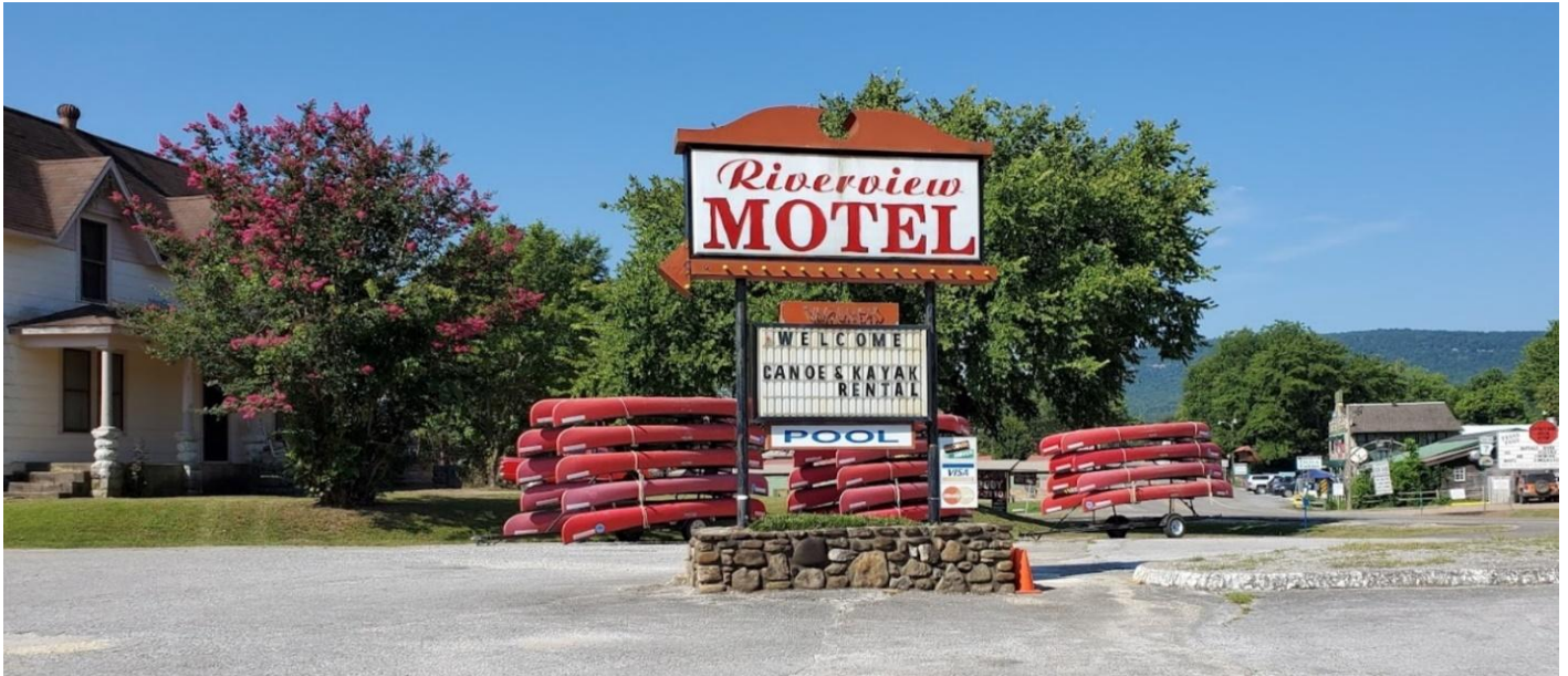
Front view from Hwy 74