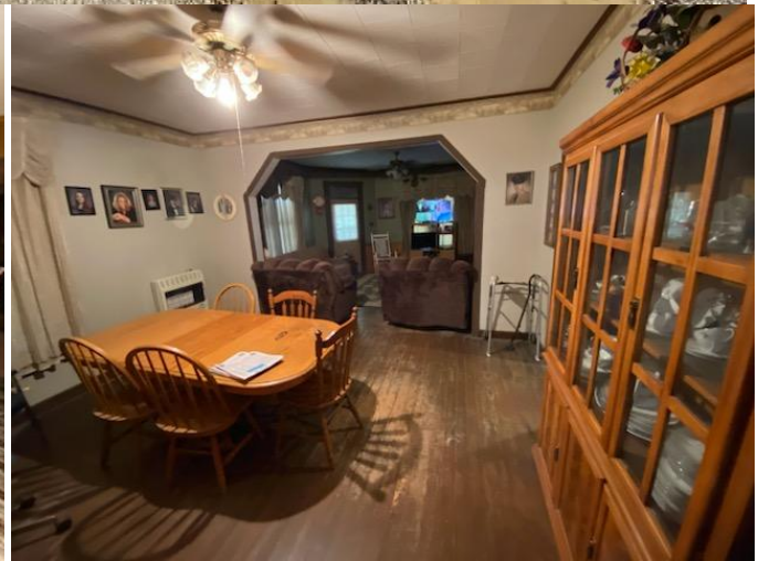
Home west side