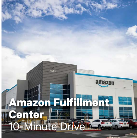
Amazon Fulfillment Center 10-Minute Drive