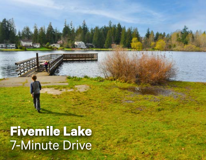
Fivemile Lake 7-Minute Drive