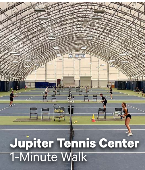
Jupiter Tennis Center 1-Minute Walk