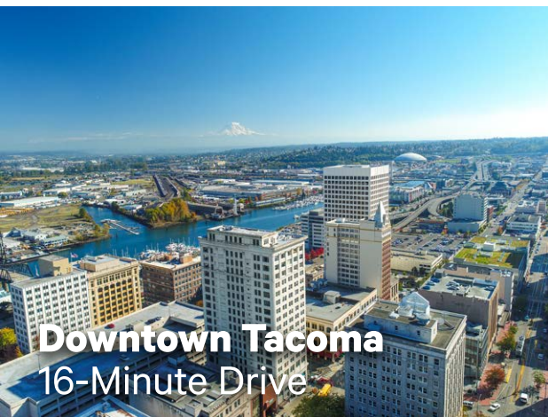
Downtown Tacoma 16-Minute Drive