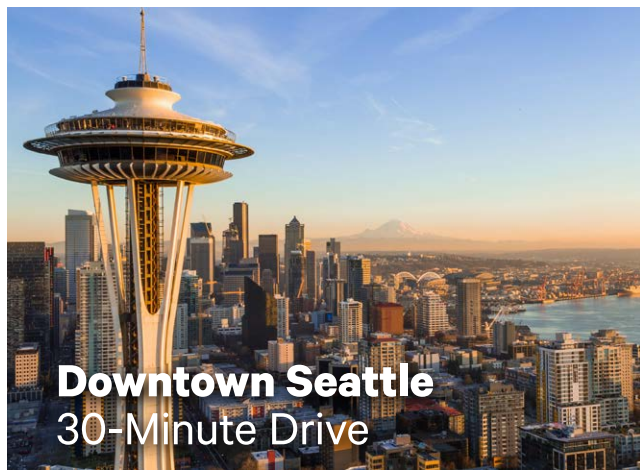
Downtown Seattle 30-Minute Drive