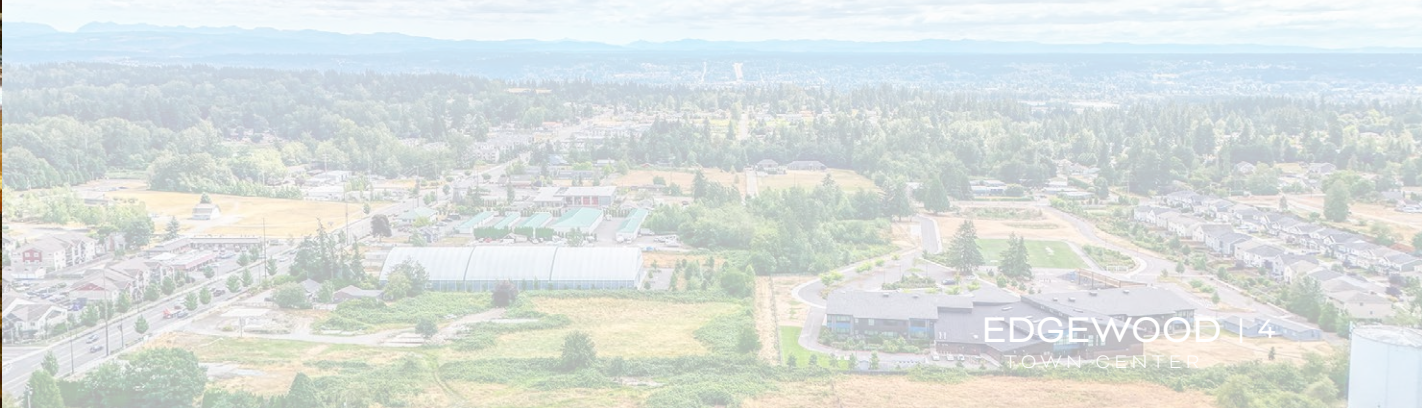
EDGEWOOD TOWN CENTER

Puyallup School District ranked among top in the state