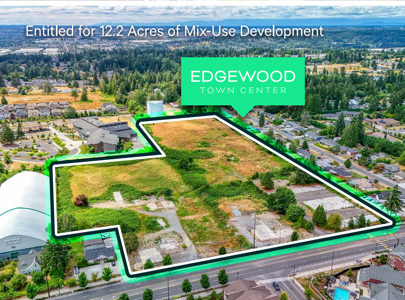
Entitled for 12.2 Acres of Mix-Use Development