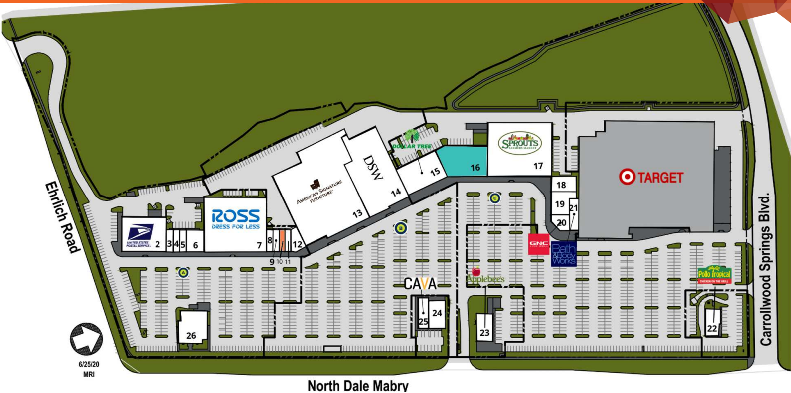
North Dale Mabry