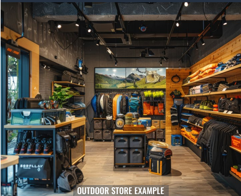
OUTDOOR STORE EXAMPLE

BRING YOUR CONCEPT TO THIS HISTORIC DOWNTOWN BUILDING