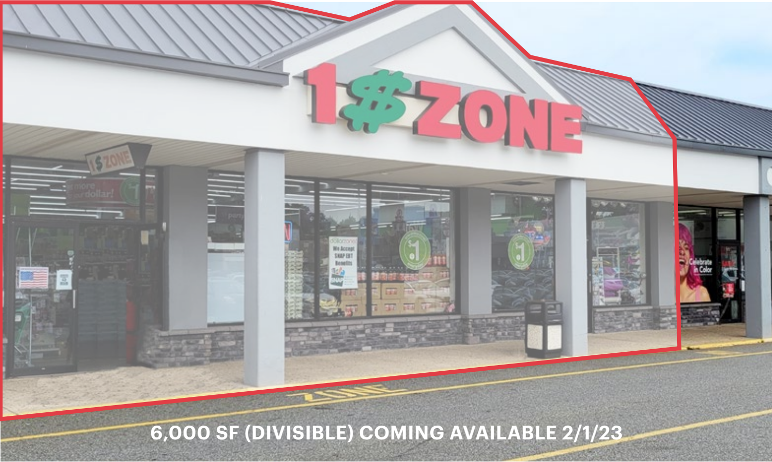
6,000 SF (DIVISIBLE) COMING AVAILABLE 2/1/23