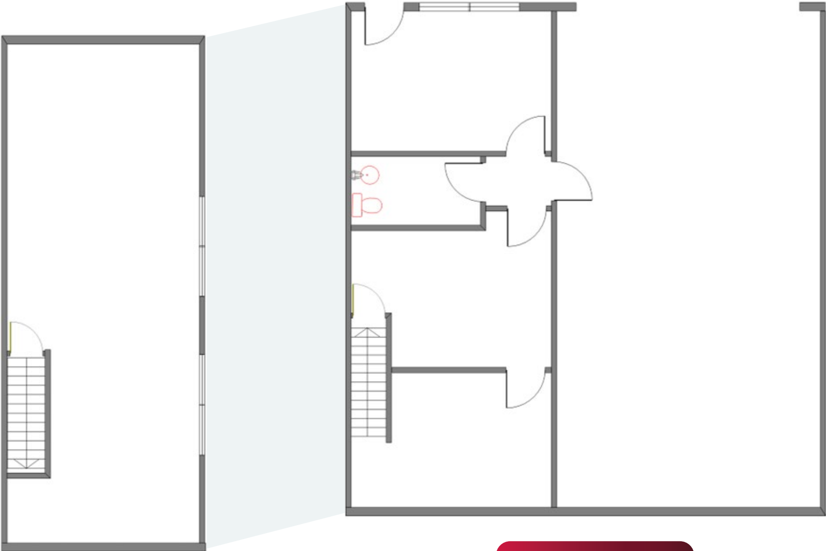
Mezzanine - ±640 SF