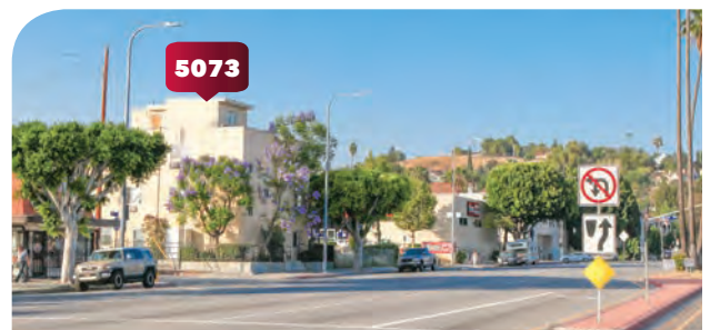
MAJOR STREET LOCATION

All information furnished regarding property for sale, rental or financing is from sources deemed reliable, but no warranty or representation is made to the accuracy thereof and same is submitted to errors, omissions, change of price, rental or other conditions prior to sale, lease or financing or withdrawal without notice. No liability of any kind is to be imposed on the broker herein.