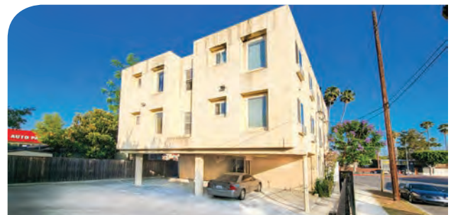
GATED ONSITE PARKING

Matt Benwitt mbenwitt@lee-re.com 818.444.4964