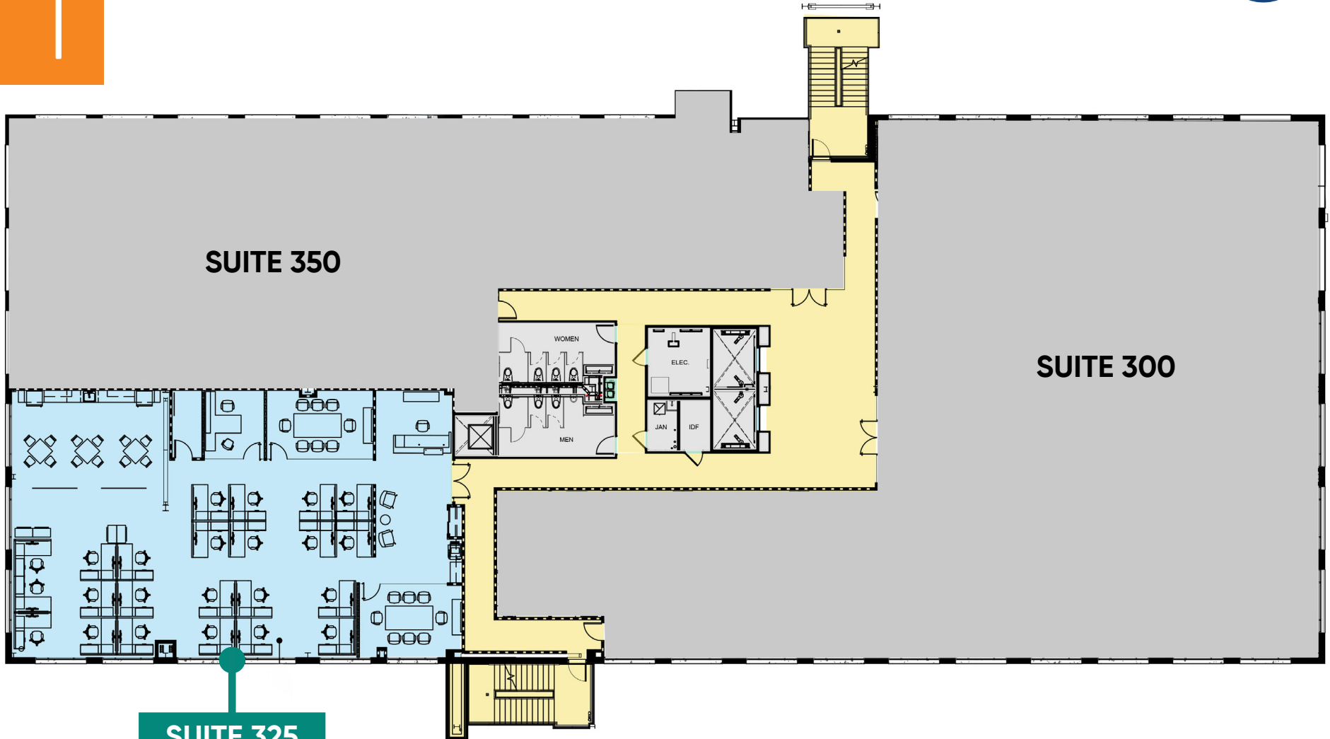
SUITE 325 4,201 RSF