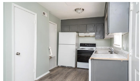
Photo is specific to Unit 1B and is for representational purposes only. See Broker for unit specifics.