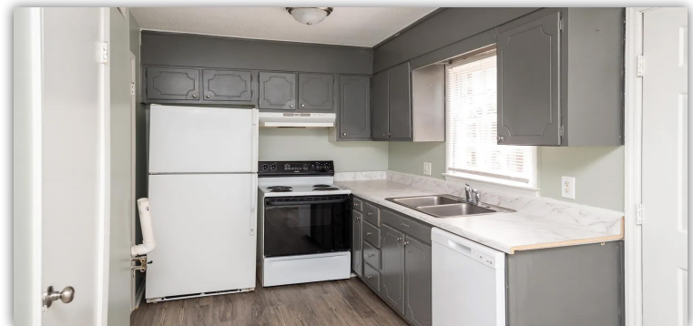
Photo is specific to Unit 1D and is for representational purposes only. See Broker for unit specifics.