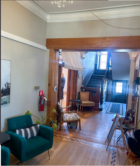
GRAND STAIRCASE & FIREPLACES