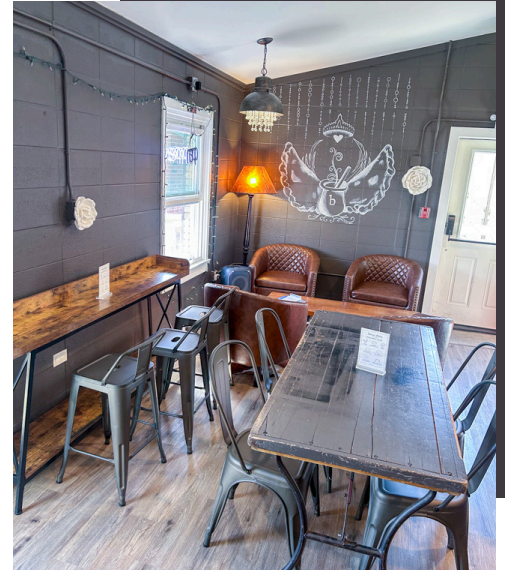
FIRST FLOOR KITCHEN & DINING AREA