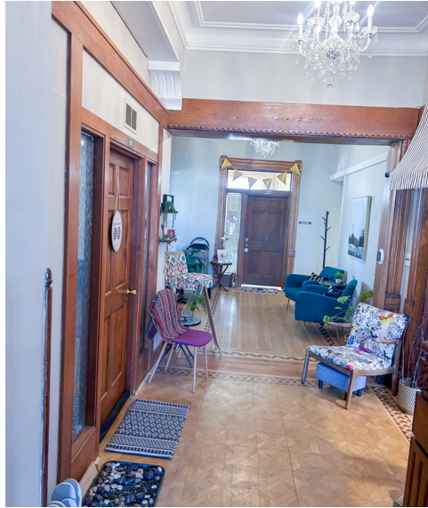
ORIGINAL DARK WALNUT TRIM