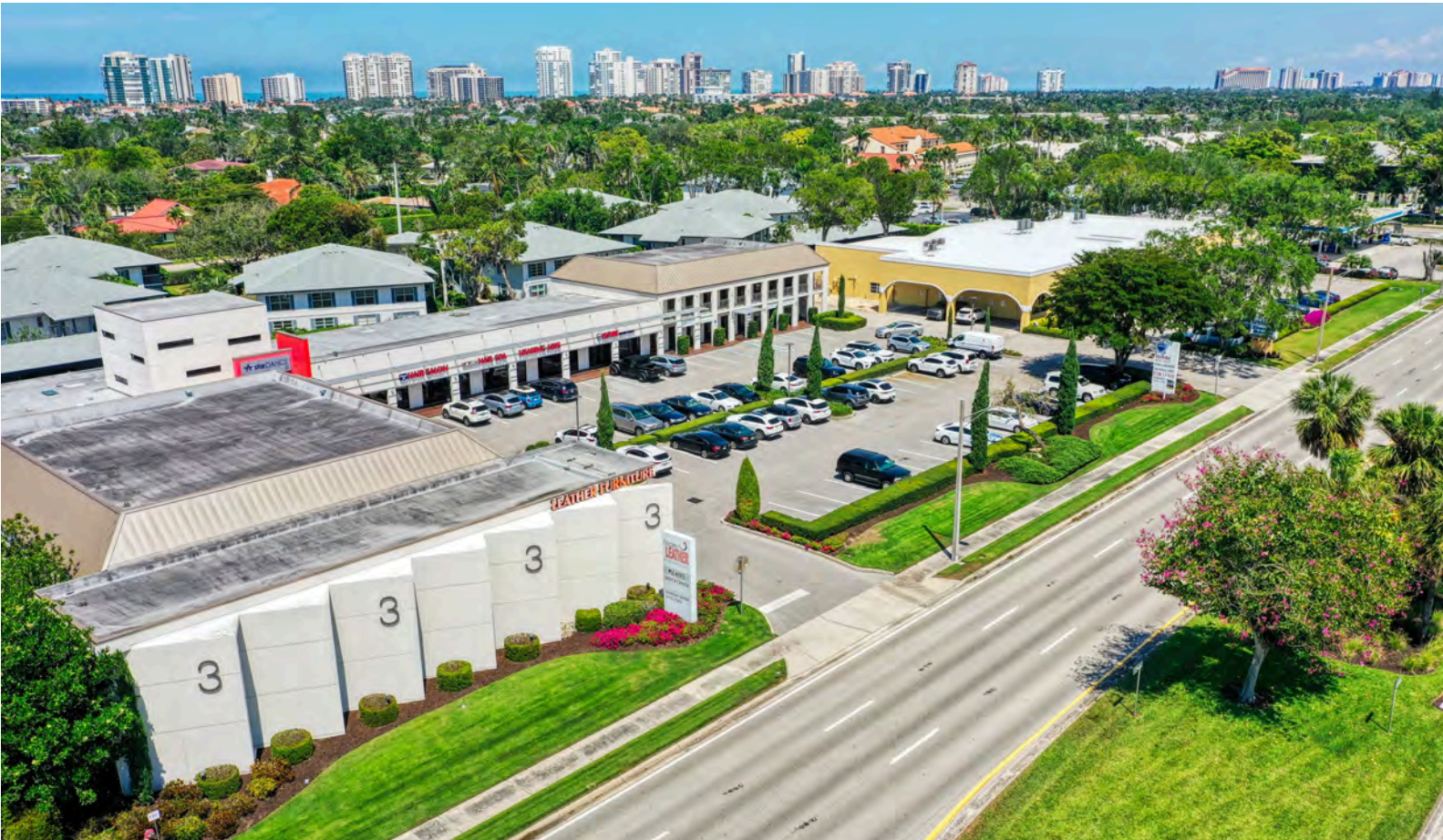
VIEW FACING NORTH

3333 9th Street North | Naples, Florida 34103