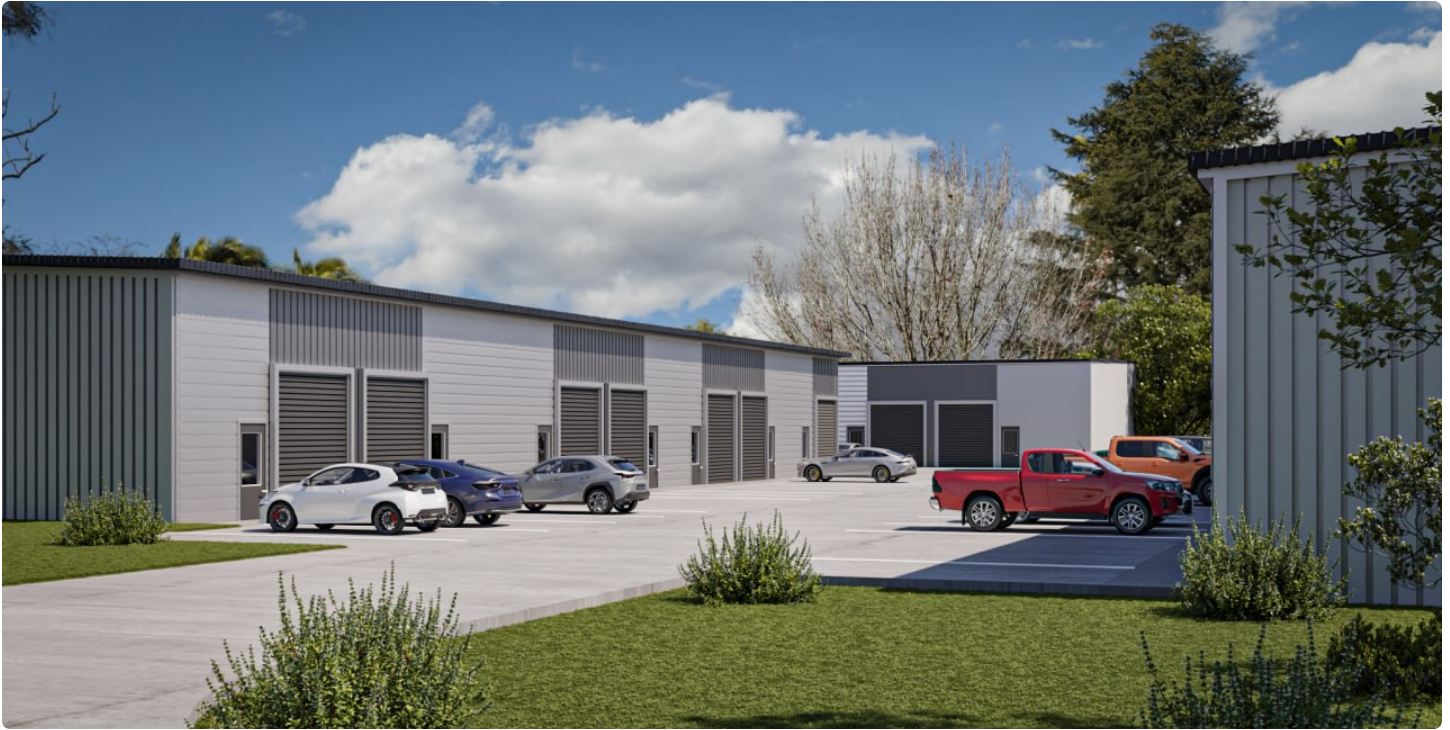
Exterior Rendering — New Construction

Elam Business Park · 2000 Elam St, Seabrook, TX 77586