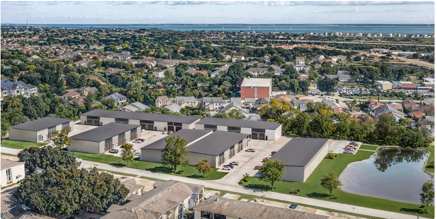
Aerial Rendering — 7 Buildings, 49 Units