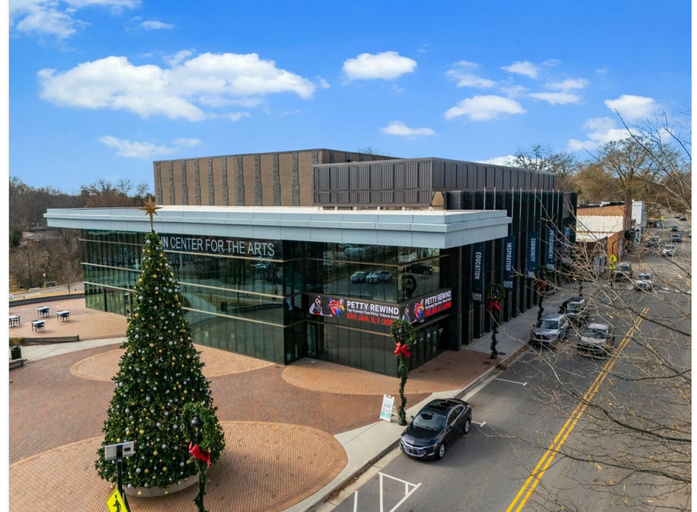
Main St_Drone-11.Cain Arts Center