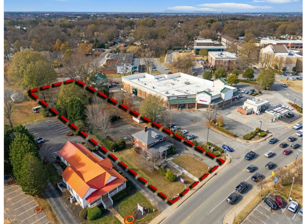
Main St_Drone-02 (Lot Outline)