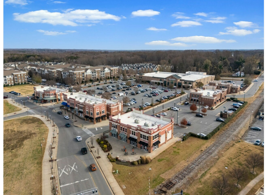
Main St_Drone-09.Antiquity Village