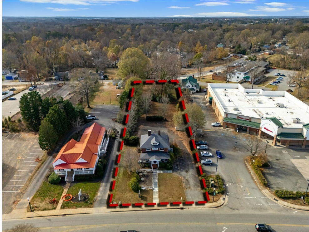
Main St_Drone-01 (Lot Outline)