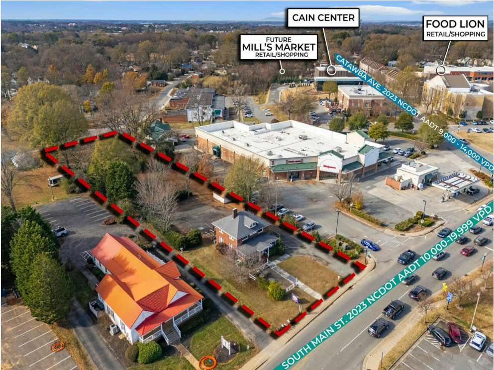
Main St_Drone-02 (Lot Outline) V2