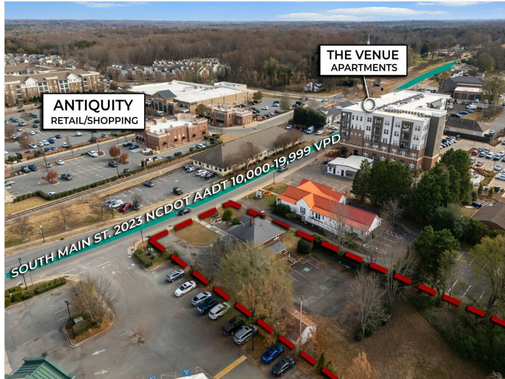
Main St_Drone-06 V2