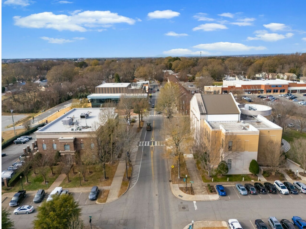
Main St_Drone-10.Catawba Ave Downtown Cornelius