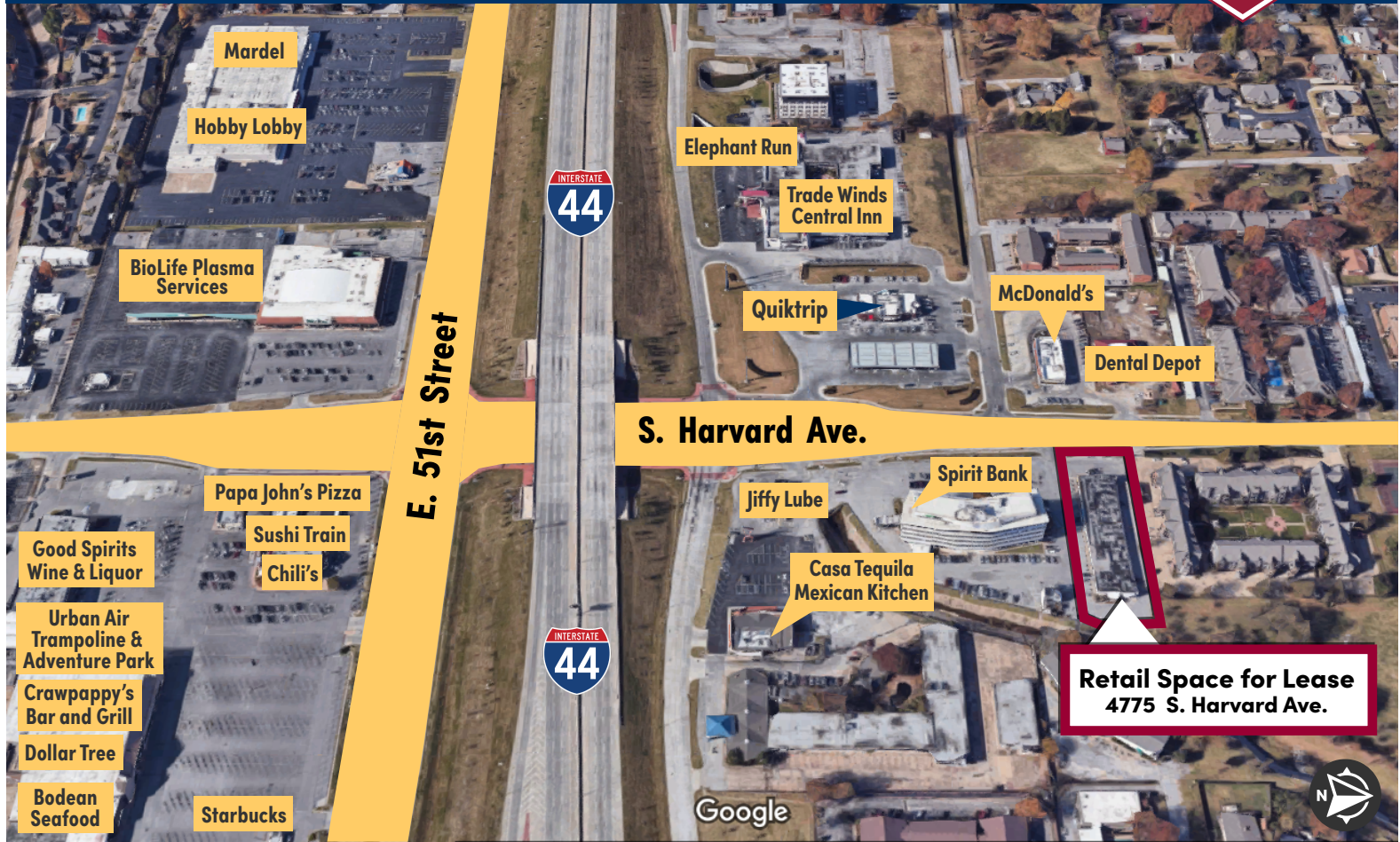
Greater Tulsa Area Map