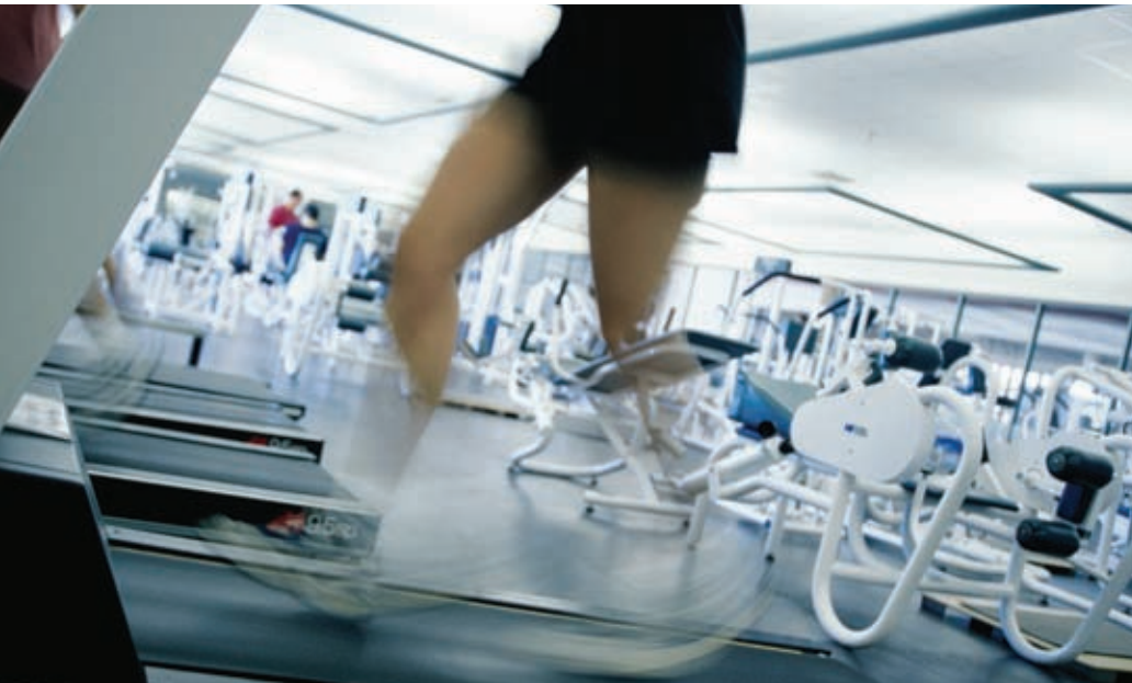
On-site Fitness Center keeps employees energized.

Concierge left voicemail. Dry cleaning is ready.