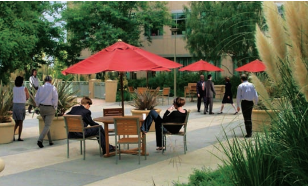
Spacious outdoor Plaza is both a workspace and a gathering place.

What a view. And that jogging trail next door is calling my name. Tomorrow morning I'm there.