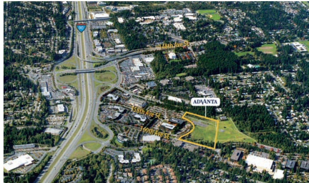
Advanta is the only Class A office space in development along Bellevue's I-90 corridor.

Time is precious. And nobody wants to spend more of it in their car than they have to. At Advanta, your employees are close to home, which means they won't mind spending some extra time at the office. And your company is close to where business gets done. Located in Bellevue on the I-90 corridor, Advanta delivers easy access to your clients, vendors and partners throughout the region. And for those meetings at your office, getting to Advanta is just as simple—we're right off the freeway.