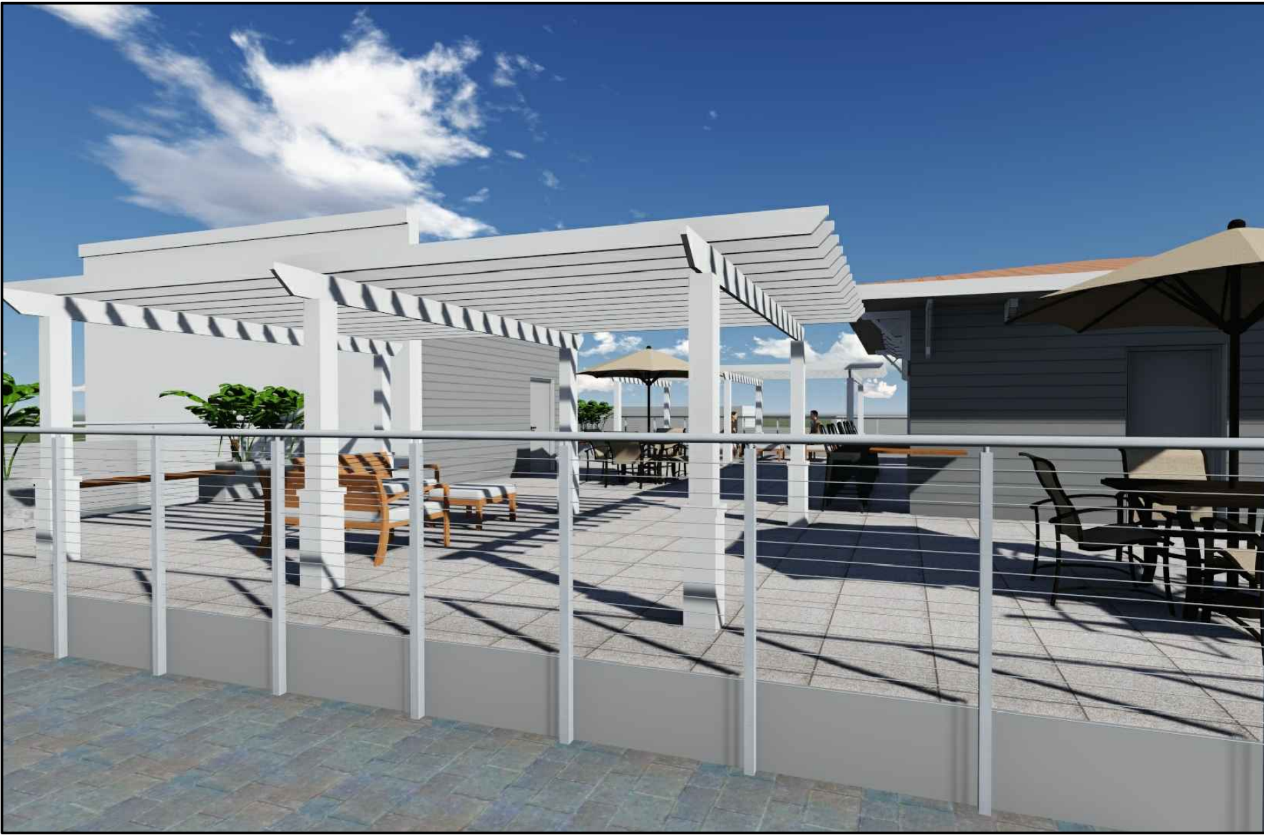
ROOF DECK PICTURE