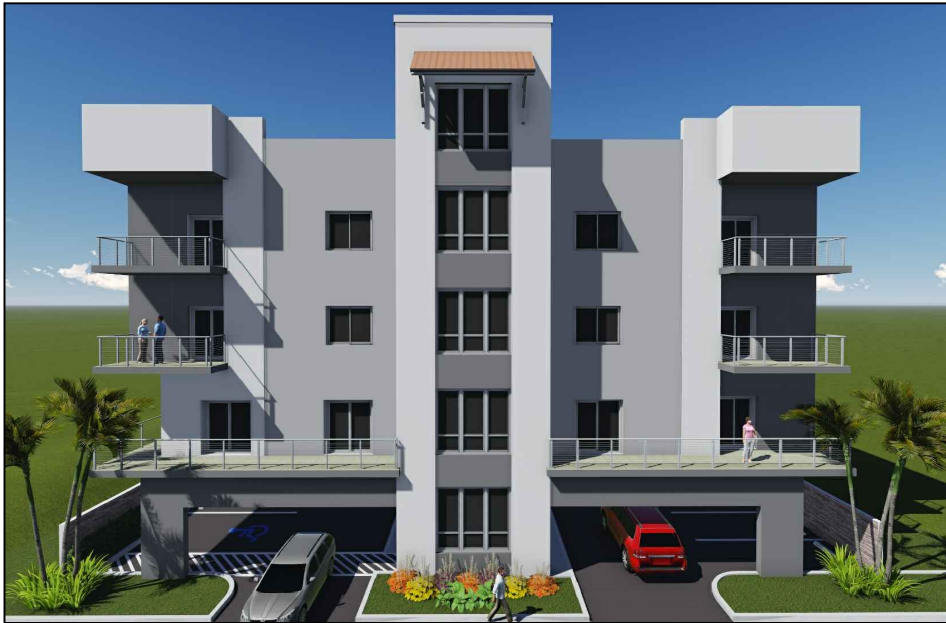
FRONT ELEVATION SOUTHWEST