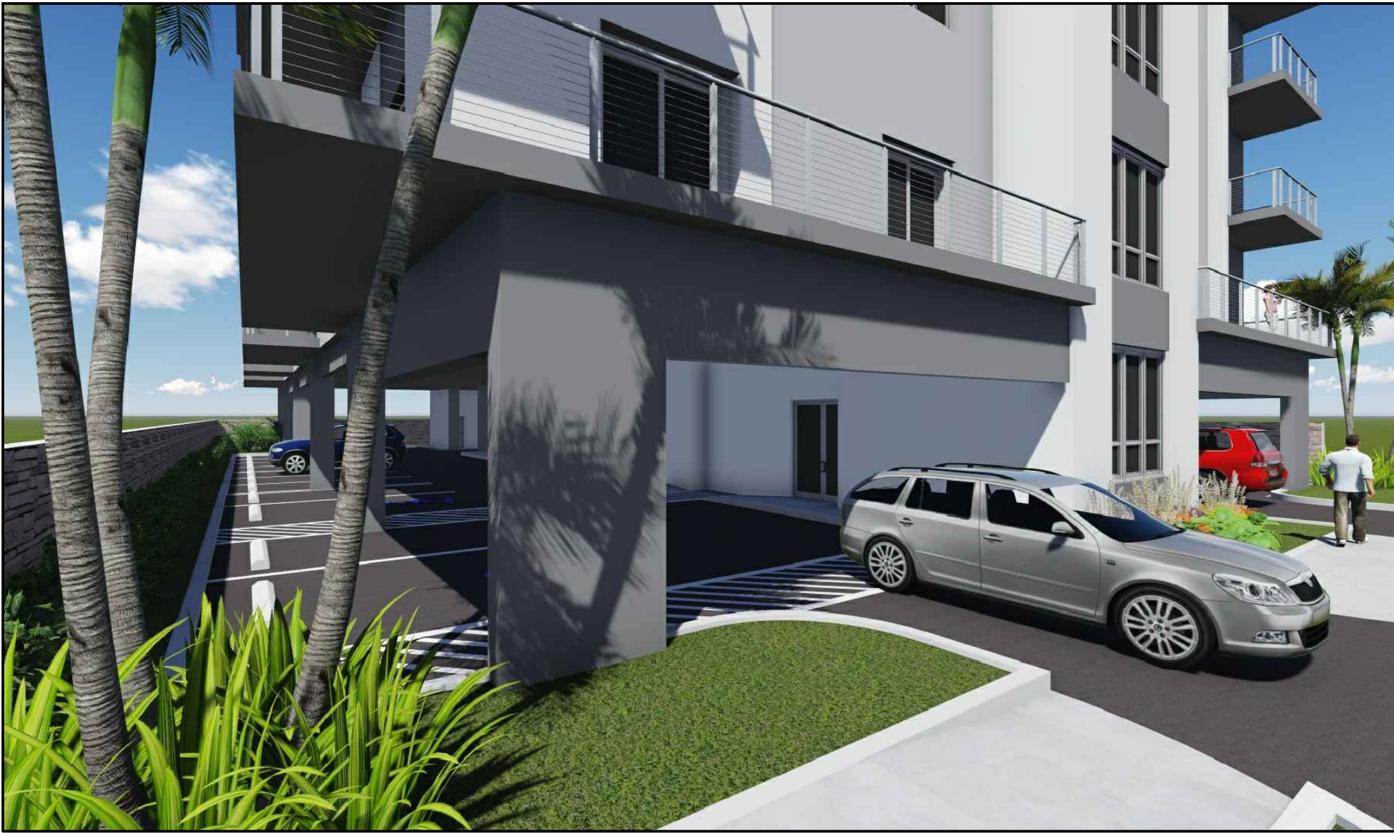
FRONT ELEVATION DETAIL