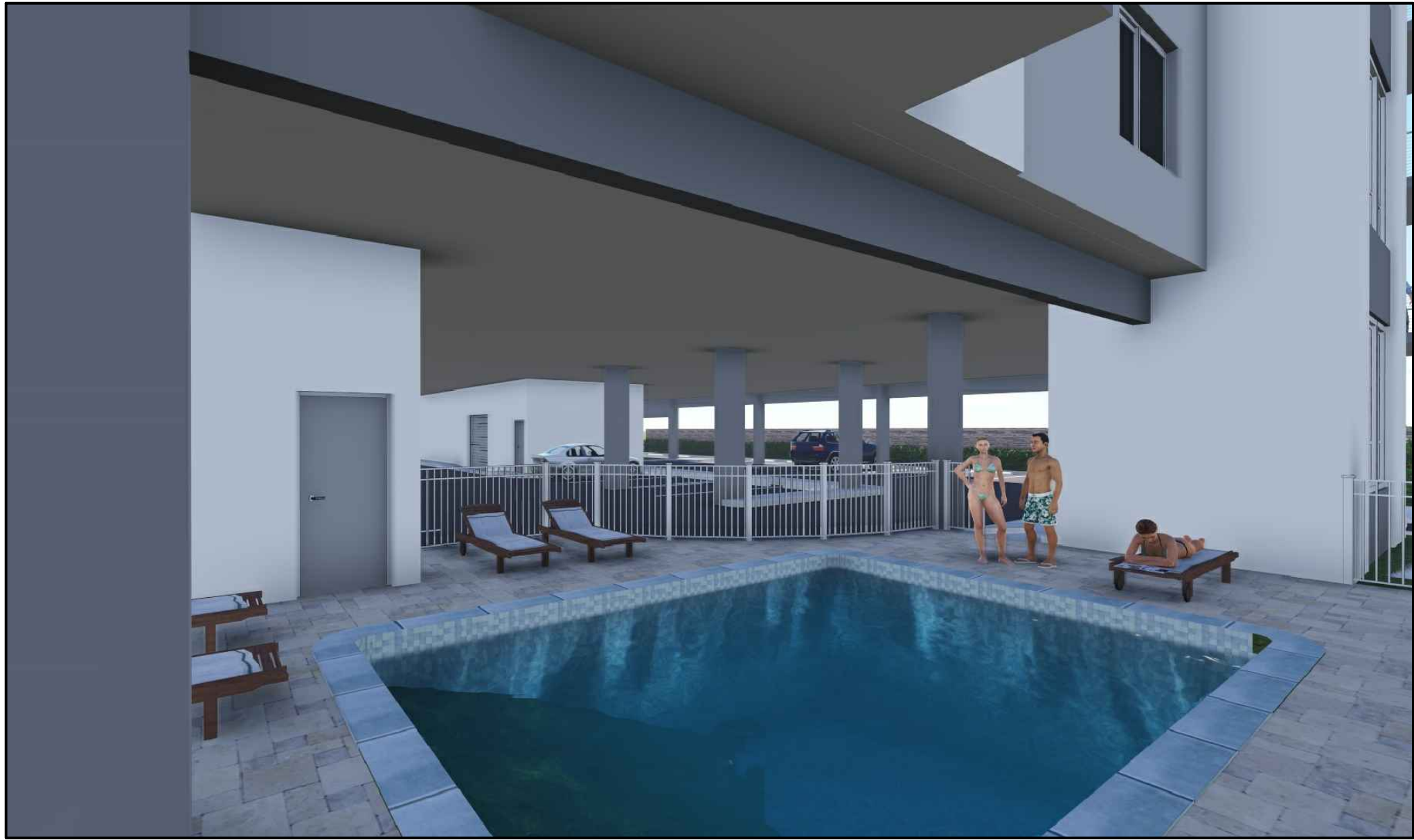
POOL AREA PICTURE