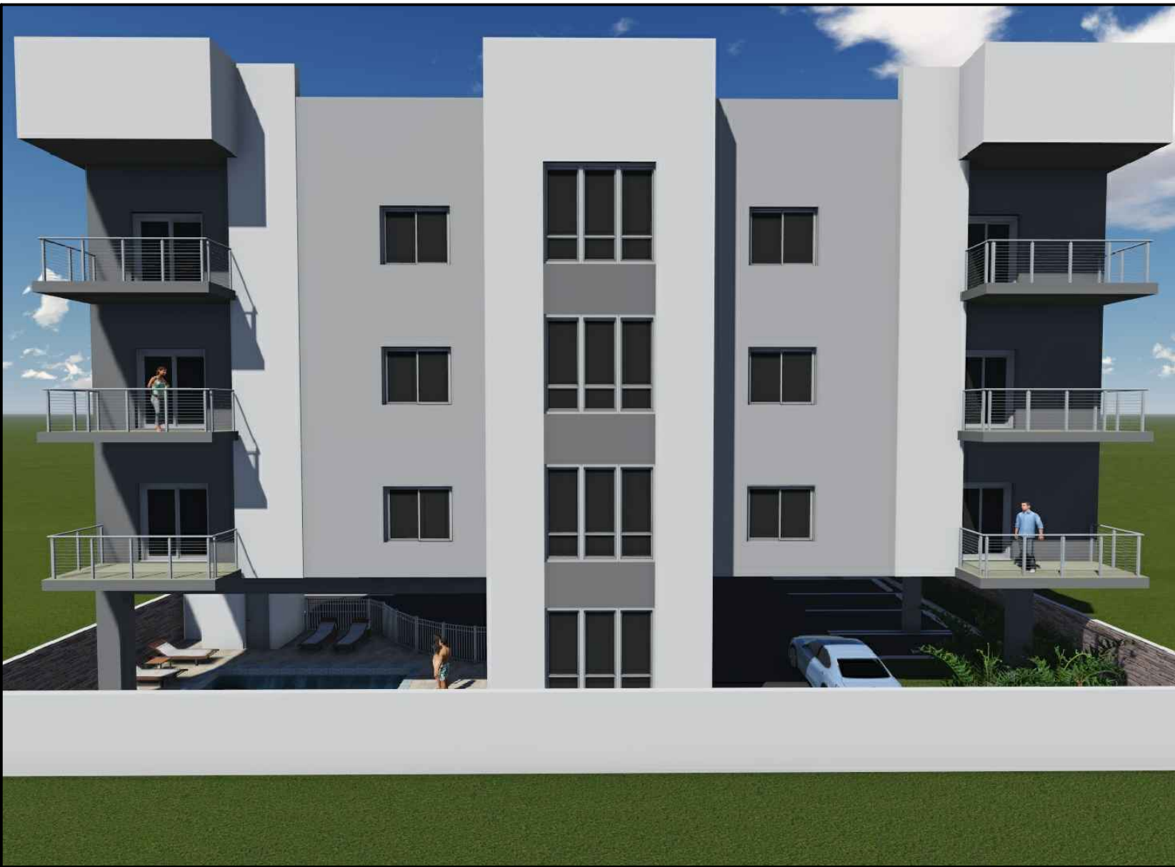
REAR ELEVATION NORTHEAST