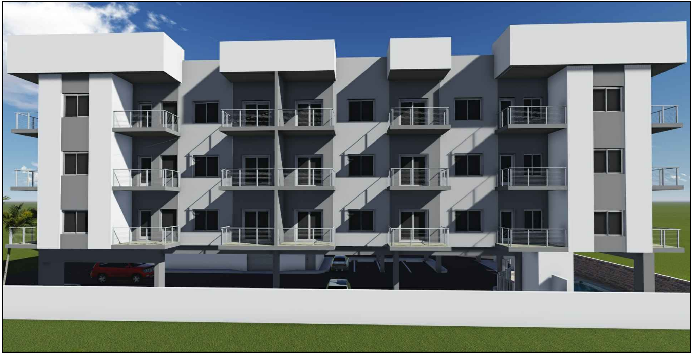
SIDE ELEVATION SOUTHEAST