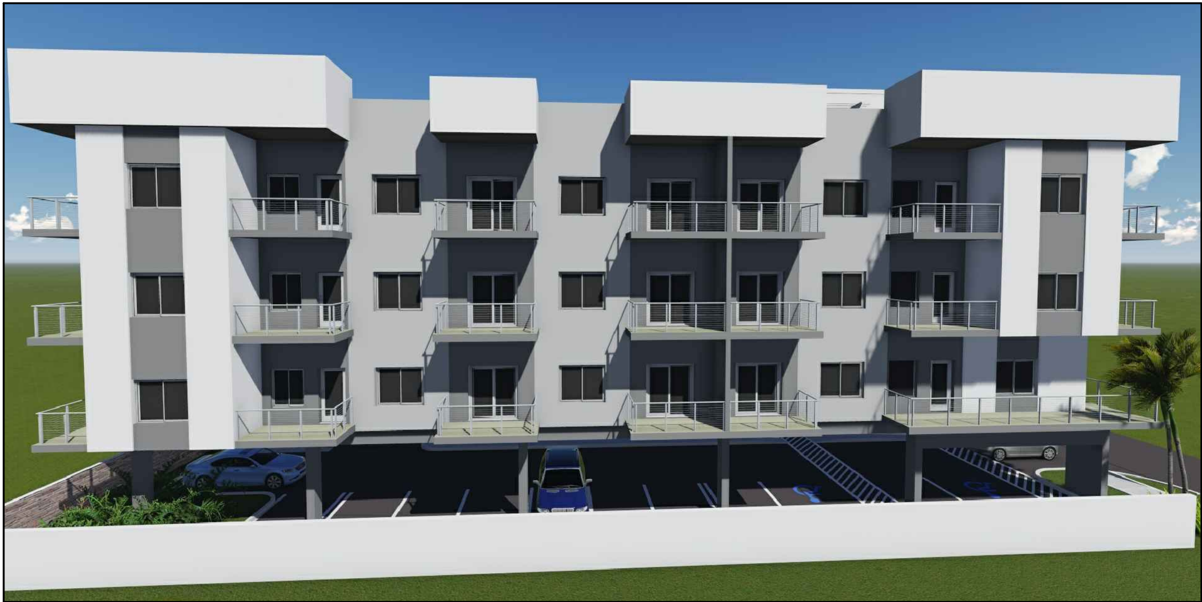
SIDE ELEVATION NORTHWEST