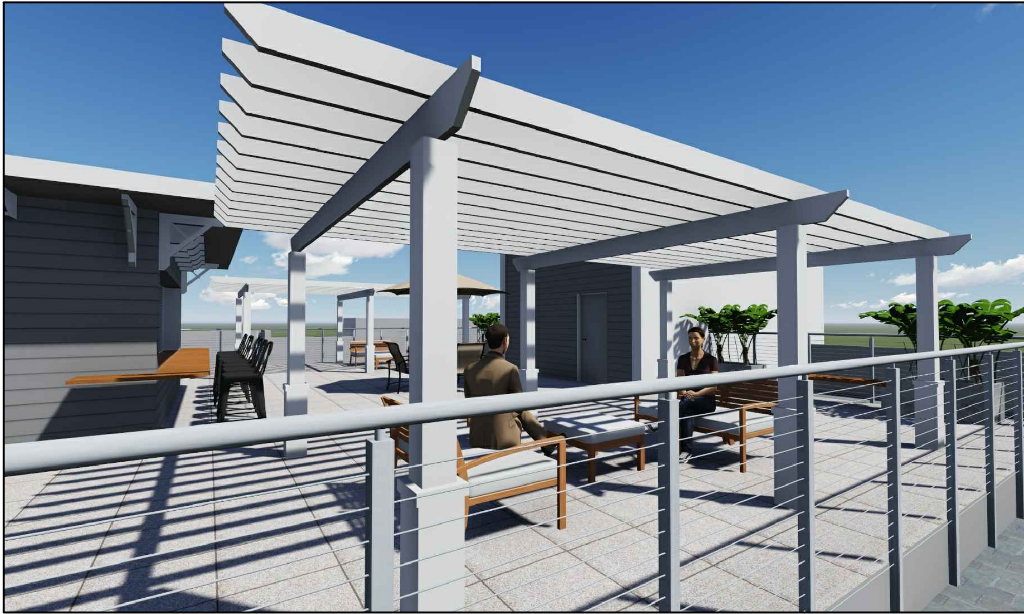
ROOF DECK PICTURE