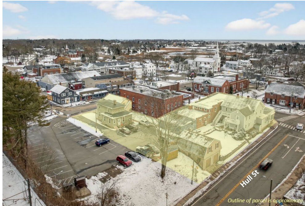
Outline of parcel is approximate

ASSESSMENT: $887,500 (2025) TAXES: $22,364.76 –(pd thru Jan 2026)