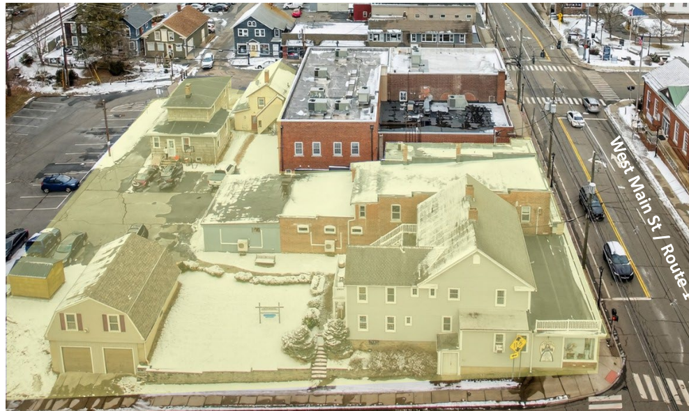
Outline of Parcel is Approximate