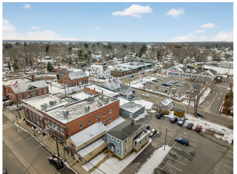
Outlines of Parcels are Approximate