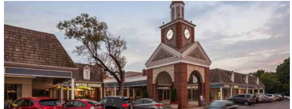
SHOPS OF PRAIRIE VILLAGE