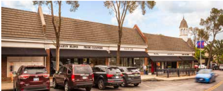
SHOPS AT FAIRWAY