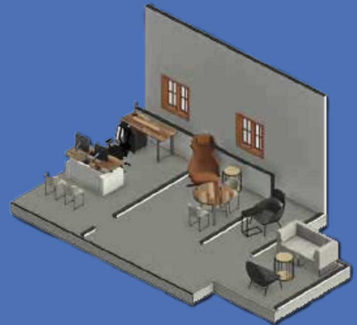
EXAMPLE SUITE 244: 430 SF