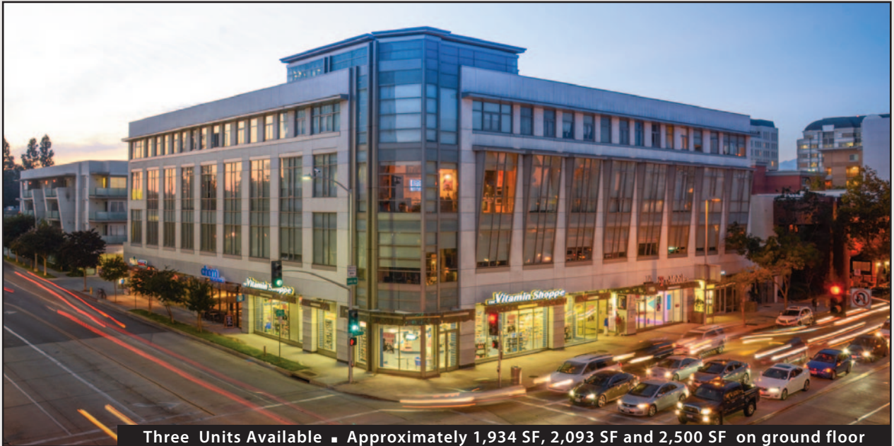
Three Units Available ■ Approximately 1,934 SF, 2,093 SF and 2,500 SF on ground floor