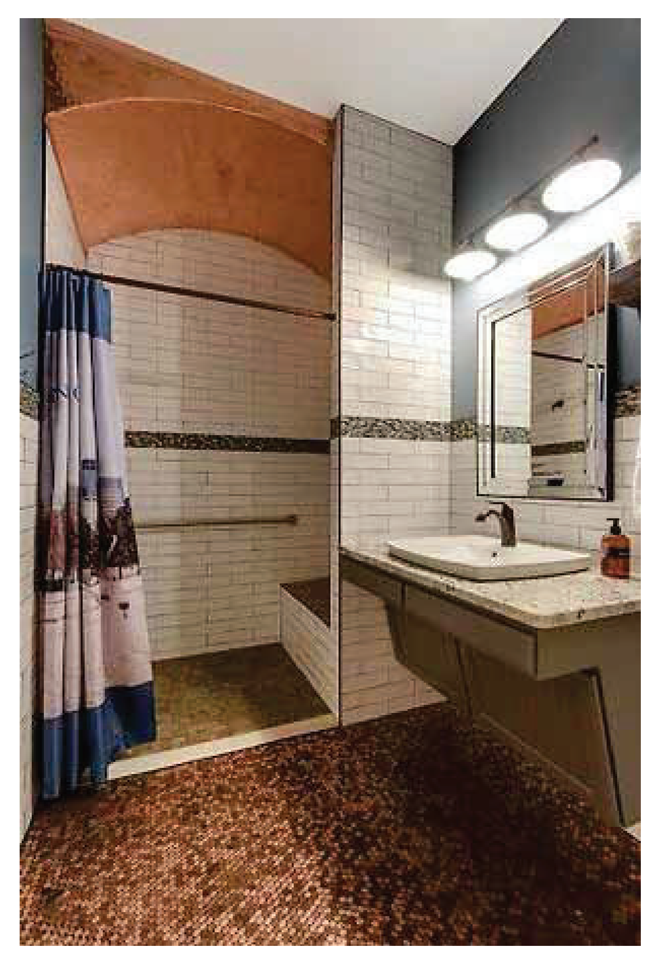
Check out this floor with pennies inlaid into it !!!