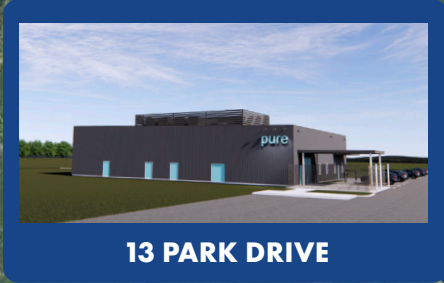
13 PARK DRIVE