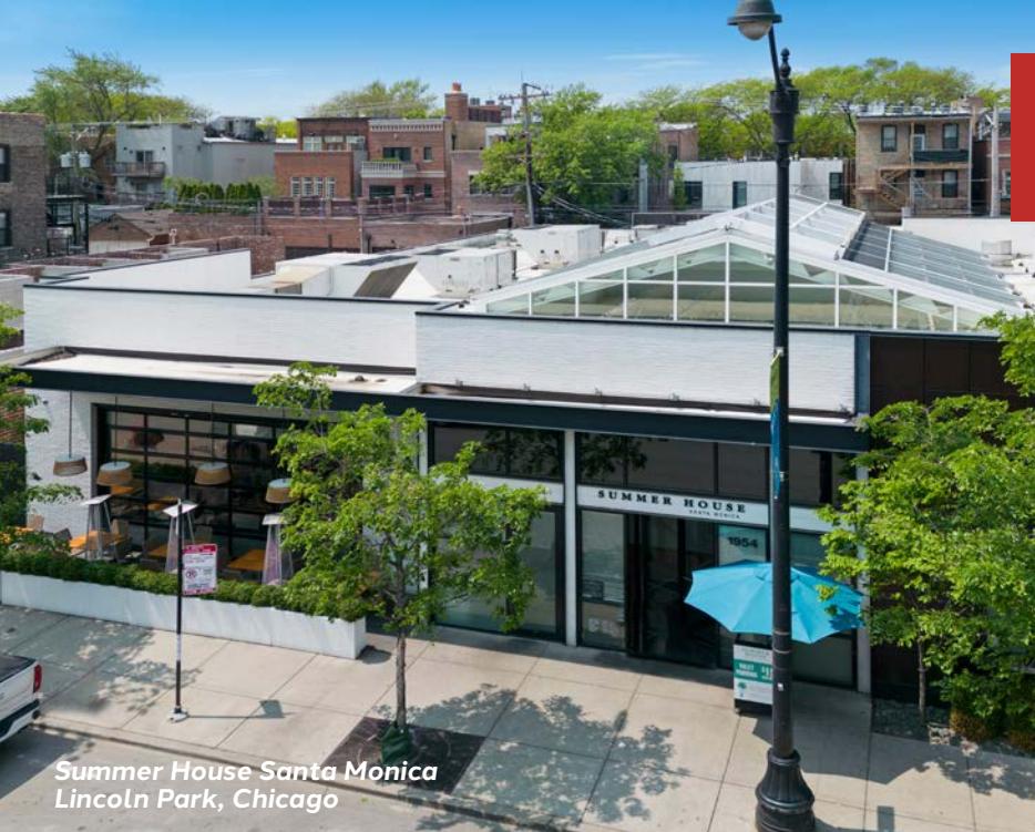
Summer House Santa Monica Lincoln Park, Chicago