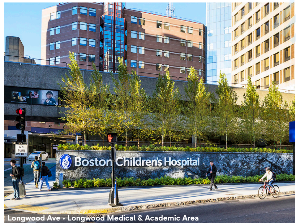
Longwood Ave • Longwood Medical & Academic Area