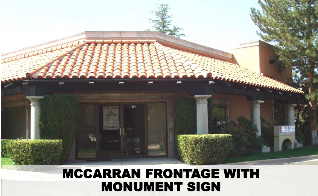
MCCARRAN FRONTAGE WITH MONUMENT SIGN