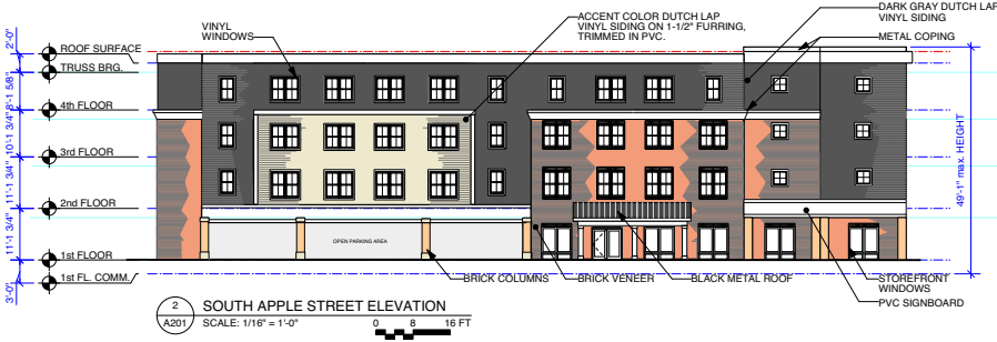
2 SOUTH APPLE STREET ELEVATION SCALE: 1/16" = 1'-0" 0 8 16 FT