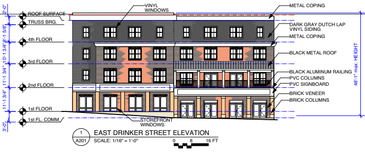
1 EAST DRINKER STREET ELEVATION SCALE: 1/16" = 1'-0" 0 8 16 FT